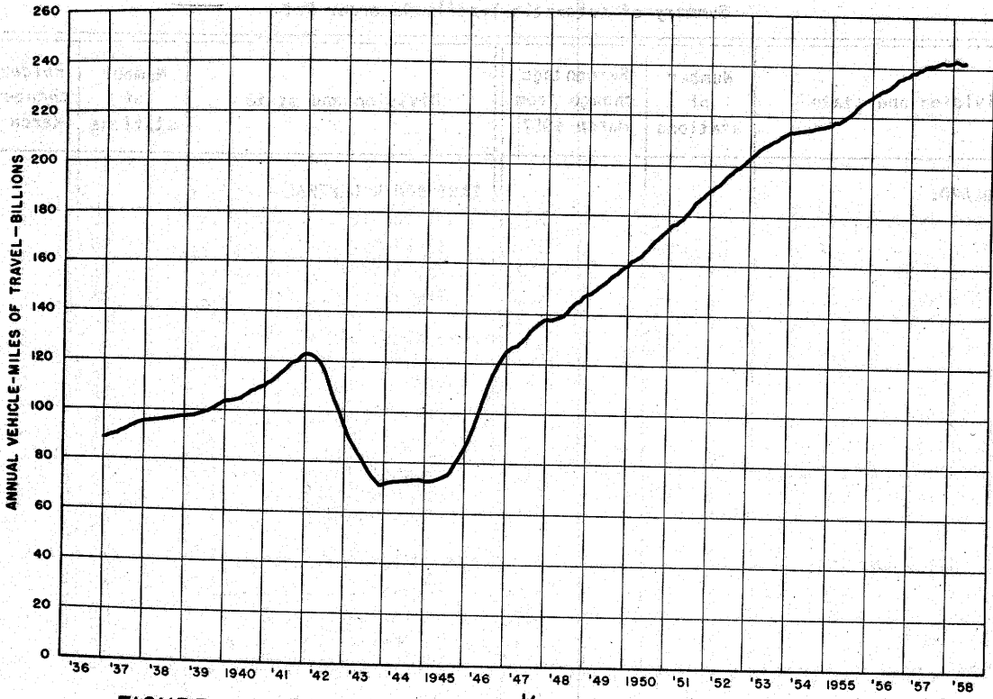
FIGURE 2—TRAVEL ON MAIN 1 RURAL ROADS BY 12-MONTH PERIODS ENDING EACH MONTH, IN VEHICLE-MILES