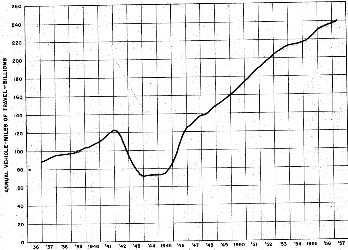
FIGURE 2 — TRAVEL ON MAIN 1/2 RURAL ROADS BY 12-MONTH PERIODS ENDING EACH MONTH, IN VEHICLE-MILES