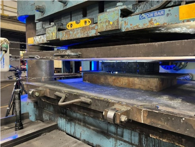
Figure 1: Sketch and photos from deployed instrumentation tree.

Key parameters for future studies were outlined, including extended testing and microscopic examination of PTFE surfaces to better understand the dependencies of friction coefficients on load cycles, sliding speeds, and surface contamination. Additionally, unexplored factors such as eccentric loading and surface roughness were identified, necessitating further experimental investigation.