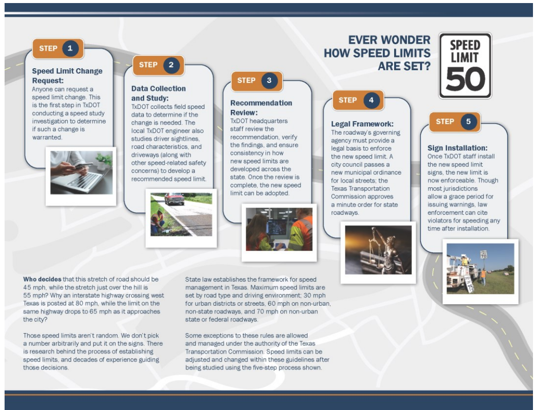
Figure 2. Inside of Pamphlet.

informed dialog about speed limits, speed-limit-setting procedures, and other speed-related issues—including safety. The results from the survey of state speed management practices and the workshop developed during the research effort aim to improve consistency in both statewide speed-limit-setting procedures and the deployment of speed management devices. Finally, findings from the research regarding the factors that most affect driver speed selection in higher speeds driving environments inform the profession on potential means to influence driver behavior.