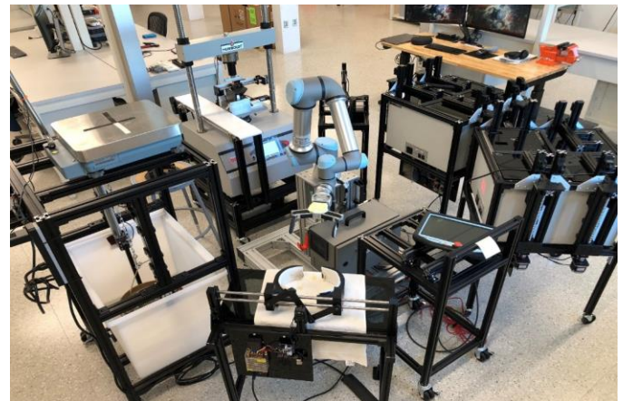
Figure 1. AMAZE Device.

The researchers designed and tested each of the five units to ensure that they worked as planned. Furthermore, the researchers evaluated the AMAZE with multiple asphalt mixture specimens in terms of air voids, cracking resistance, rutting resistance, and indirect tensile (IDT) strength.