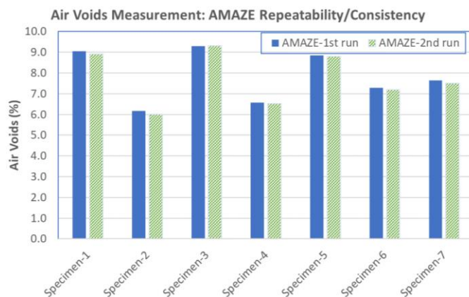
Figure 3. Consistency of AMAZE-Measured Air Voids.