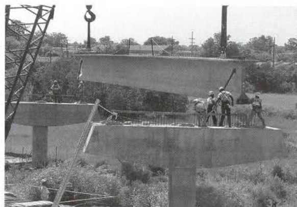
The first concrete girder is set into place between two pier caps for the new bridge's Meeting Street off-ramp.

With a project budget of $677 million, SCDOT had to develop an innovative financing plan that includes several partners.