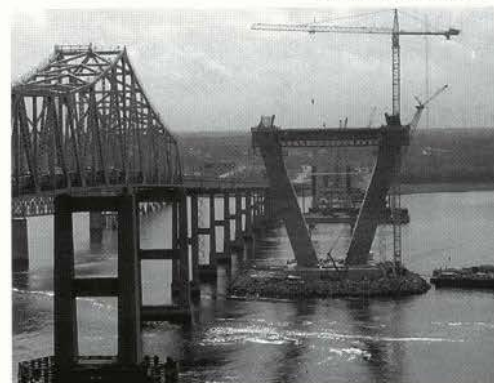
This view of the new Cooper River Bridge under construction in Charleston, SC, shows reinforcing steel in the bridge's Eastern Tower.