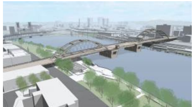
Figure 3. Example of the preferred alternative, a replacement long span bridge.

Multnomah County held a virtual public meeting via a web conferencing platform and a livestream platform on February 3, 2021, before publication of the Draft EIS. Thirty-two participants attended the web conference meeting, and 10 participants viewed the livestream.