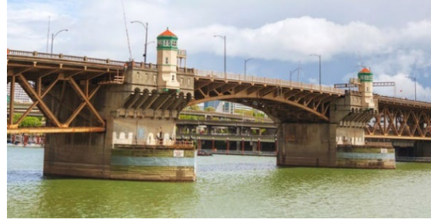
Figure 2. Photo of the current Burnside Bridge. It was completed in 1926.

To market the Online Open Houses, Multnomah County posted advertisements to social media. The project team noted that paid advertisements on a particular social media site reached the most people, with 6,970 impressions. Outreach during the pre-NOI project phase also included holding community tabling events, contacting businesses through phone canvassing, and mailing flyers to share information with stakeholders in the project area. Multnomah County also created a website using an interactive web mapping platform, to The project team also continued to offer briefings to