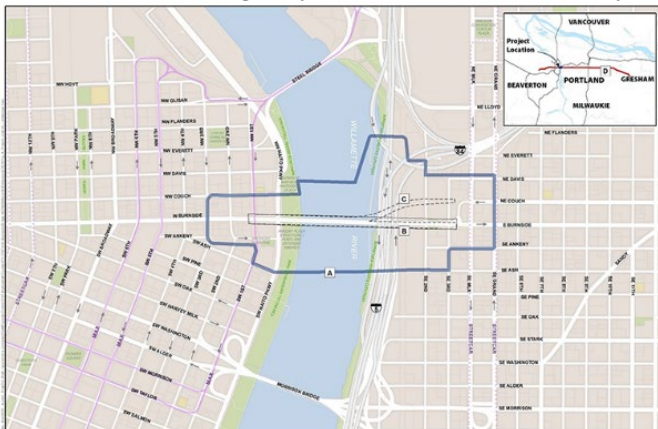
Figure 1. Map of the project area for the Earthquake Ready Burnside Bridge.

The Earthquake Ready Burnside Bridge Project proposes to replace a 96-year-old bridge in downtown Portland, Oregon, with a new bridge designed to withstand earthquakes (see Figure 1). The 19-mile-long Burnside Street, which includes the Burnside Bridge, was designated a regional lifeline route in 1996; the street and bridge allow emergency services to respond after a major earthquake or other disaster. Replacing the bridge will support emergency response and recovery.