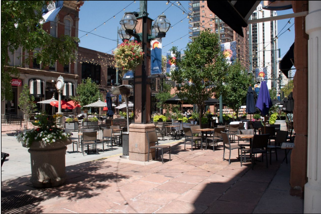
Figure 3.12 Outdoor dining tables at Larimer Square in Denver block an entire sidewalk. No ramp is provided to transition to the street for navigating the dining space. Some participants said they avoid this pedestrian area because of the unpredictability of accessible paths.