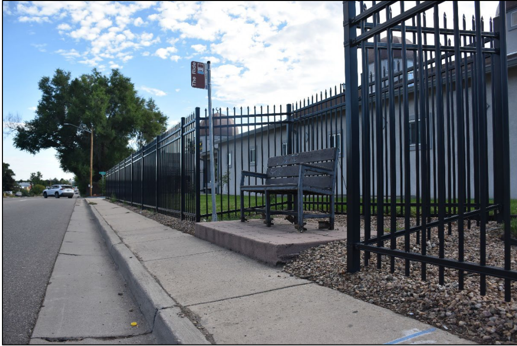
Figure 3.10 A bench is placed on a raised platform at a bus stop along a busy arterial street with a narrow sidewalk. For those who cannot easily step up to access the bench, there is no room to wait for the bus outside of the pedestrian path.