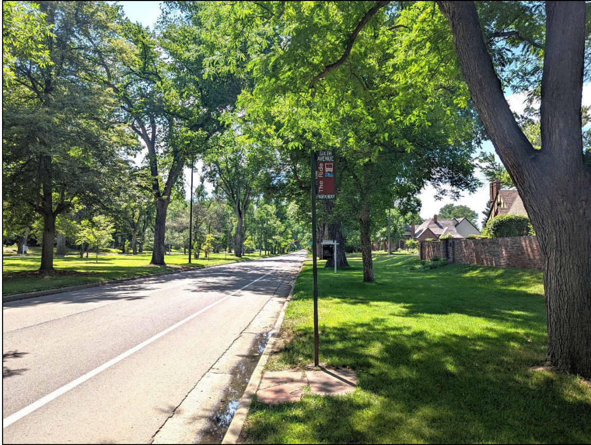
Figure 3.11 A mid-block bus stop is placed in the grass with no sidewalk access along the street. For people with disabilities, this stop may be inaccessible or challenging to access, requiring them to find an alternate, more accessible route.

Transportation professionals shared that addressing first/last-mile connections to transit is a barrier when the transit stop property (or adjacent property) is owned and managed by a combination of public and private owners, requiring additional coordination, funds, and time to address issues.