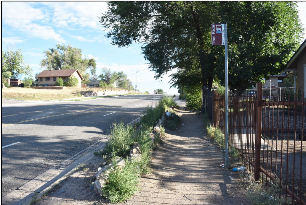
Figure 3.9 A dirt path leads to a bus stop along a high-speed, high-traffic road with no sidewalk. For those with a mobility device such as a wheelchair, traveling along this path to access the bus stop may be physically demanding.

– #5-I, Woman with multiple disabilities