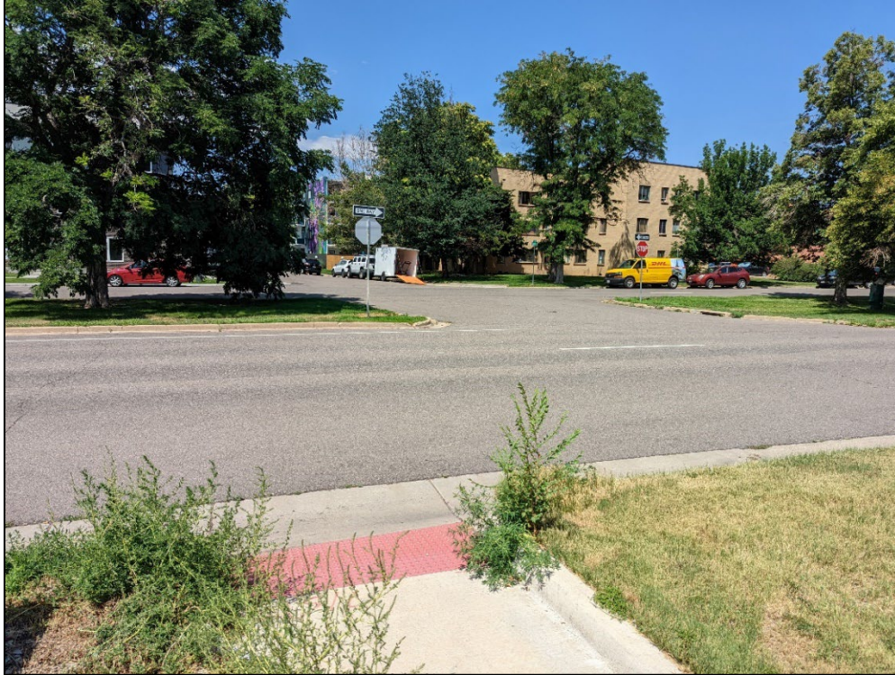
Figure 3.5 A curb ramp leads to no marked crossing or curb ramp on the opposite side of the street in a residential neighborhood in Denver. The ramp may falsely indicate a safe crossing, but if a person cannot step onto the grass median on the other side of the street, they would be forced to turn around.