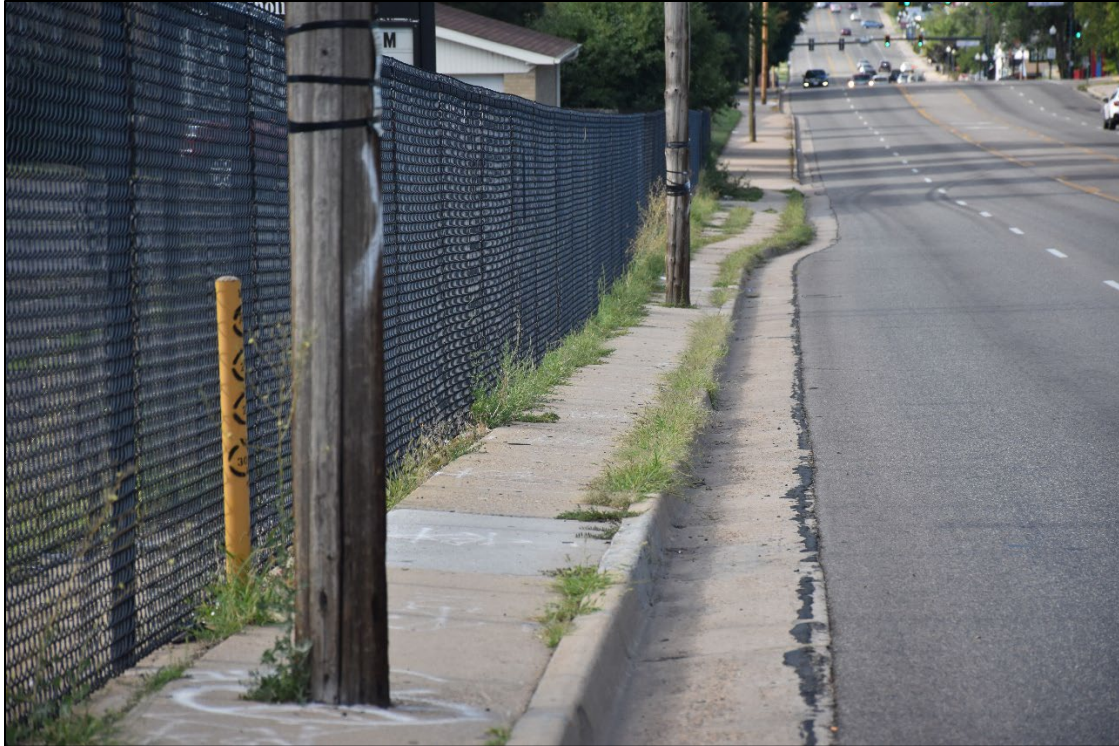
Figure 3.3 A sidewalk along Sheridan Boulevard in Denver contains utility poles in the middle of the sidewalk. The route may be impassable for some due to the narrow width or require pedestrians to step into the gutter space to pass.