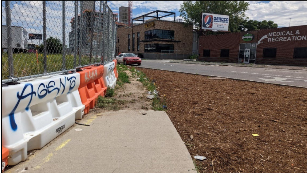
Figure 3.1 An example of a sidewalk turning into a dirt path along Walnut Street in Denver. Sidewalk gaps like this can create barriers and safety concerns for people with disabilities.