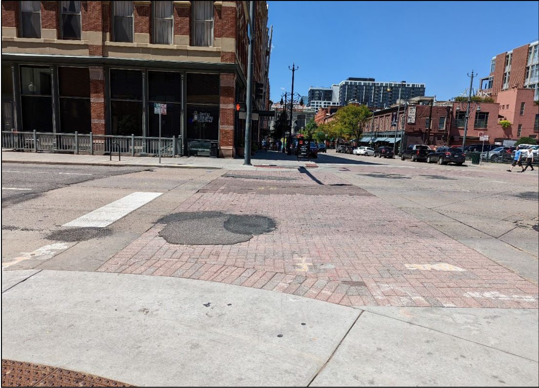
Figure 3.7 A crosswalk in downtown Denver contains brick pavers and asphalt patches creating an uneven walking surface.