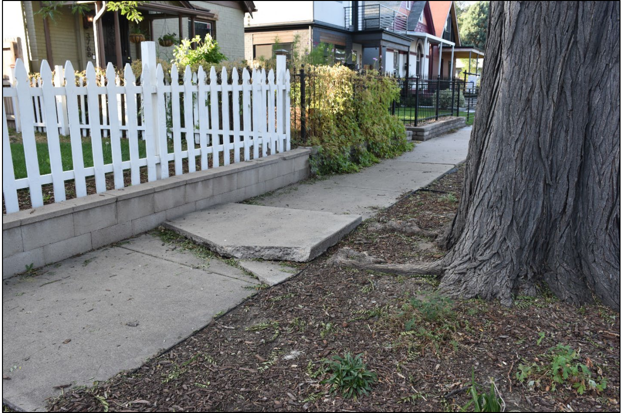
Figure 3.6 A sidewalk is displaced by a tree root, causing an uneven walking surface and safety hazard along a residential street.