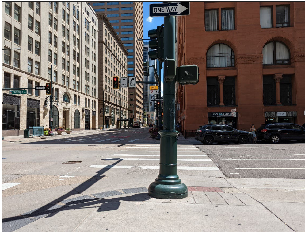
Figure 3.4 A traffic light pole obstructs direct access to a crosswalk in downtown Denver.

Regardless of disability, the lack of safe crossings (Figure 3.4, 3.5) and challenges navigating multi-stage intersection crossings can require people with disabilities to travel long distances to reach a safe crossing. The distance required to travel can be time intensive, physically demanding, or preventative altogether.