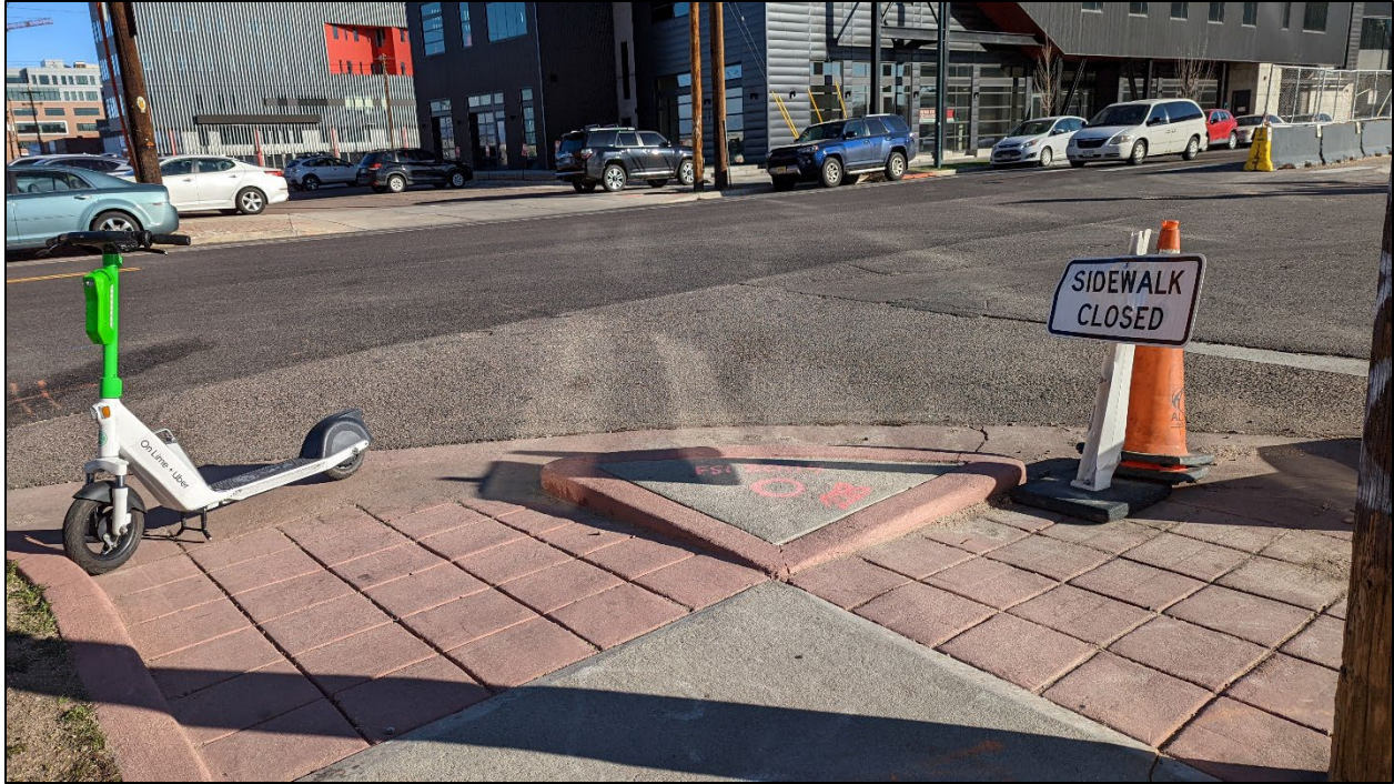
Figure 3.13 An intersection with no marked crossings. An e-scooter blocks one ramp crossing, and the other ramp is blocked by a “sidewalk closed” construction sign. This demonstrates how temporary barriers can prevent people from safely traveling to their destination efficiently and effectively.