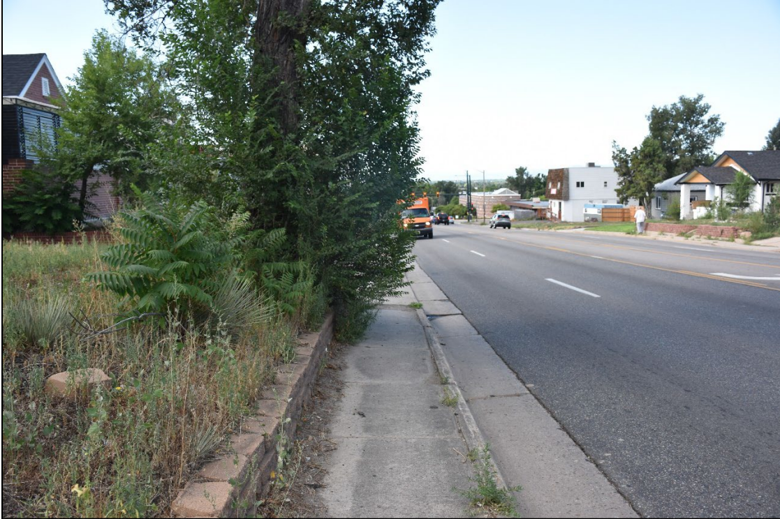
Figure 3.8 A bush encroaches on the sidewalk along Sheridan Boulevard in Denver. There is no room to travel around the bush without stepping off the curb and into the traffic lane.