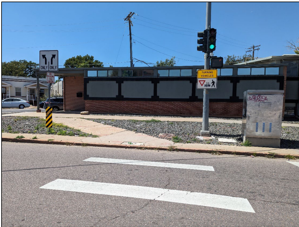
Figure 3.2 A marked crosswalk leads to a sidewalk without a curb ramp along Downing Street in Denver. The missing curb ramp may require people to find alternate routes with more accessible crossing facilities.