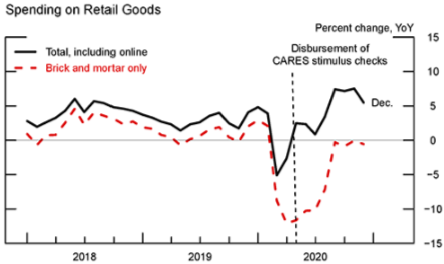
Figure 3. Spending on Retail Goods