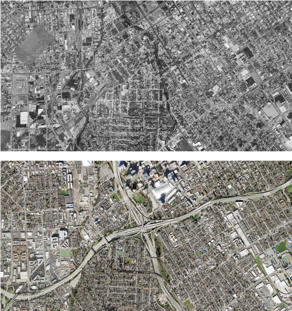
Figure 5. Satellite Images of the Study Area before and after Freeway Construction

Today, the I-280 / CA-87 freeway intersection has an air of permanence. It is an enormous piece of infrastructure, and the physical and social environment has stretched and shifted to make room for it. Thus, while the neighborhoods surrounding the intersection resemble each other, it is hard to imagine how they were once connected before the freeways. Noting that around 500 parcels were demolished to make room for just this one intersection, we can only imagine how many people were impacted by the freeway project as a whole. Similarly, faced with tens of boxes with