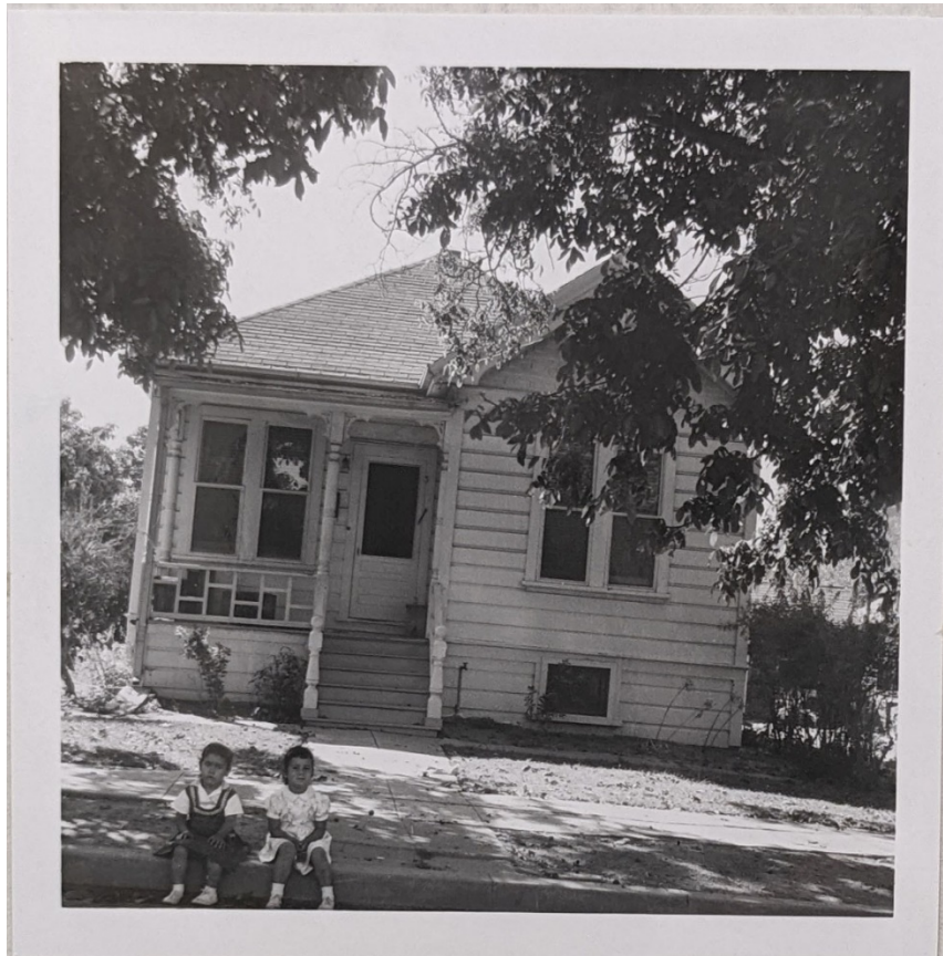
Figure 3. Photograph of Children Posing in Front of 440 Illinois Ave.