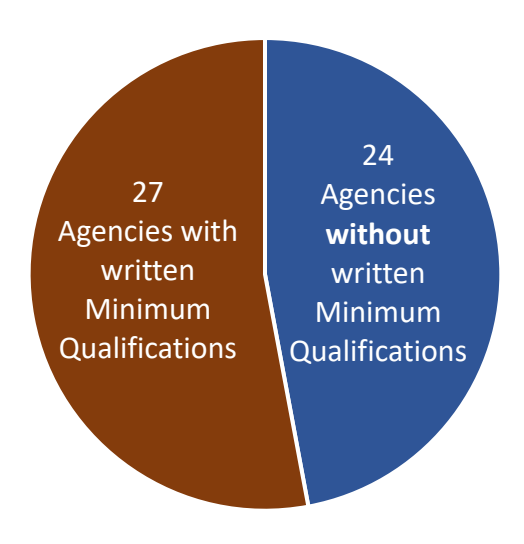
Figure 3. Number of Respondents that Have Written Minimum Qualifications for Staff Conducting Valuations

Slightly more than half of survey respondents report having published minimum qualifications for persons conducting waiver valuations. However, examination of many of these qualifications reveal that they are written for generic job titles by agency HR departments and are not written to ensure qualification to perform waiver valuations. From the interviews and surveys, the agencies rely on experienced trained staff to conduct valuations. But only about half of the respondents have written minimum qualifications for staff that perform valuations, as shown in Figure 3.