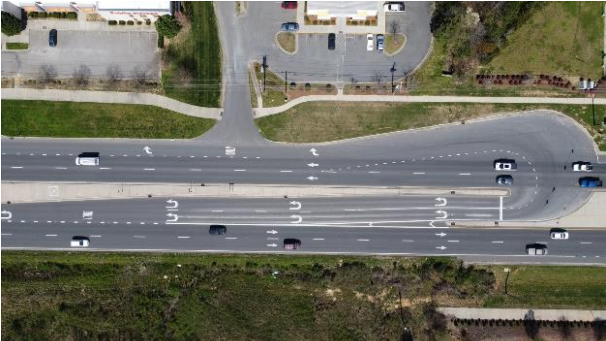
Figure 1. Example of two-lane U-turn signalized intersection in North Carolina.

a loon (see example of such a design in North Carolina in Figure 1). The design should consider the needs of pedestrians and bicyclists and could include overhead lighting to illuminate bikeway and pathway networks in advance of all intersection crossings.