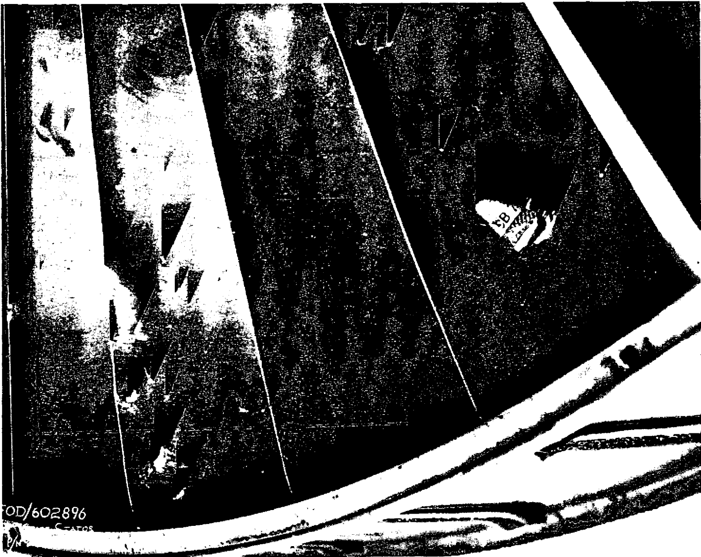
FIGURE 3. FOREIGN OBJECT DAMAGE AND METAL EMBEDDED IN VANE. NOTE THIS PIECE OF METAL DID EXTENSIVE DAMAGE TO SEVERAL VANES.