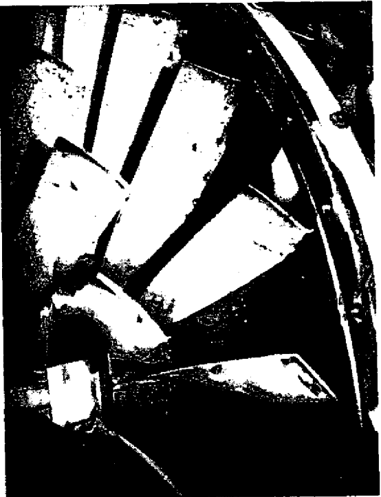
FIGURE 1. OBJECTS INGESTED. IN LEFT PHOTO NOTE THE EXTENSIVE DAMAGE TO VANES CAUSED BY PLEXIGLASS. IN RIGHT PHOTO NOTE THAT THE NUT WAS EMBEDDED IN THE VANE.