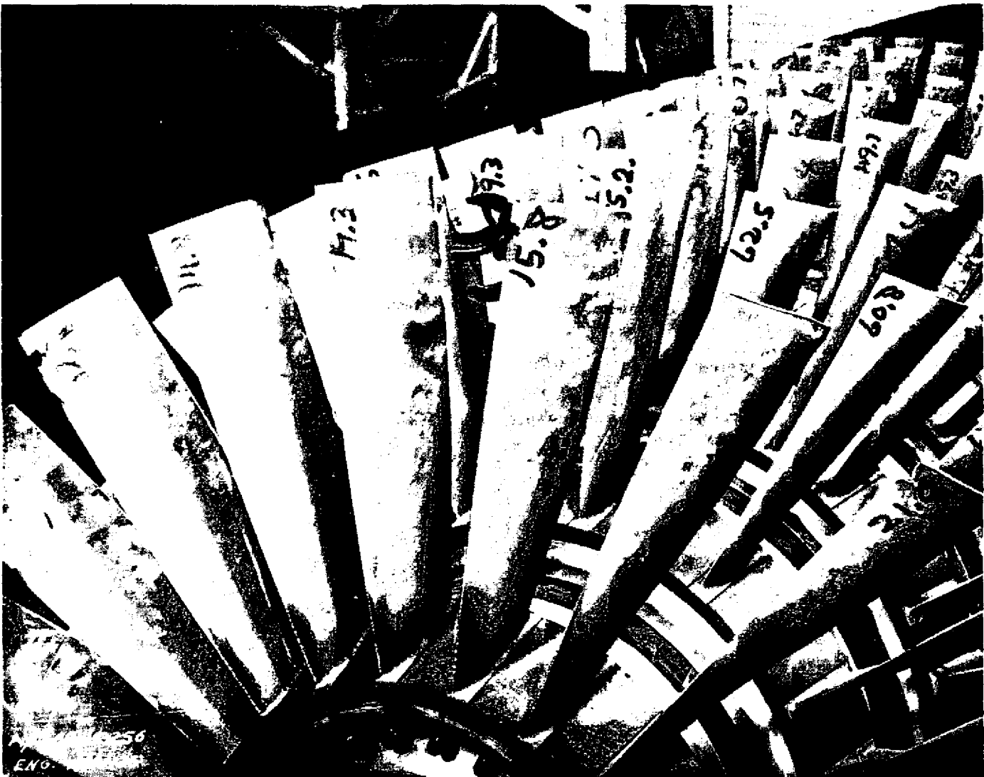
FIGURE 4. INGESTION OF CLAMP TYPE DEVICE. NOTE THE LARGE NUMBER OF VANES DAMAGED, THE EXTENT AND UNIFORM TYPE OF DAMAGE.