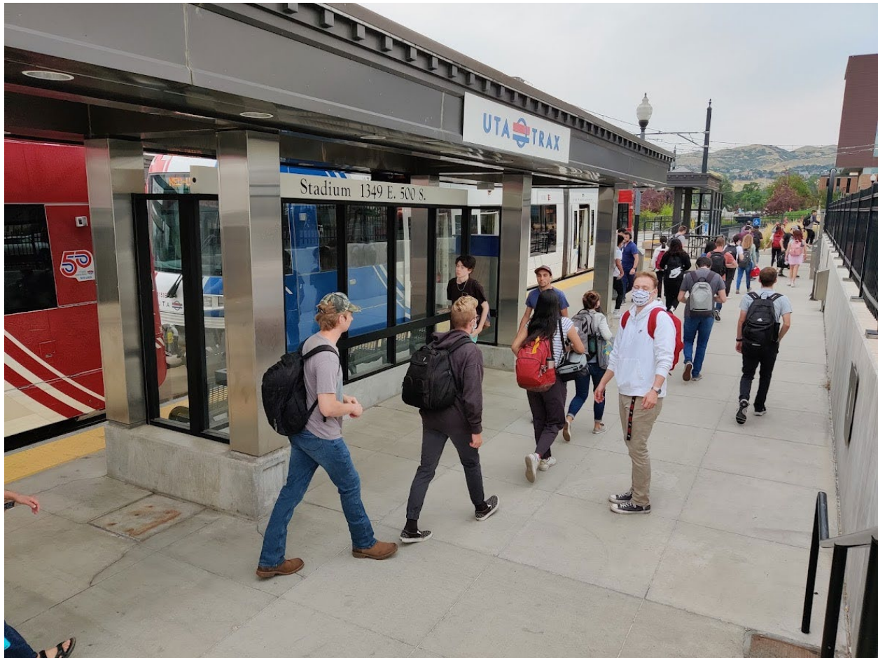
Figure 1: People at transit station with and without masks

Khan felt less safe in the captive environment of the train without the presence of the operator. However, transit employees' own behavior and enforcement of public health measures varied, and feelings of safety among riders shifted with enforcement. Salvador described a worrisome experience early in the pandemic when bus drivers were reluctant to wear face masks and were unsupportive of public health measures. Salvador went into detail: