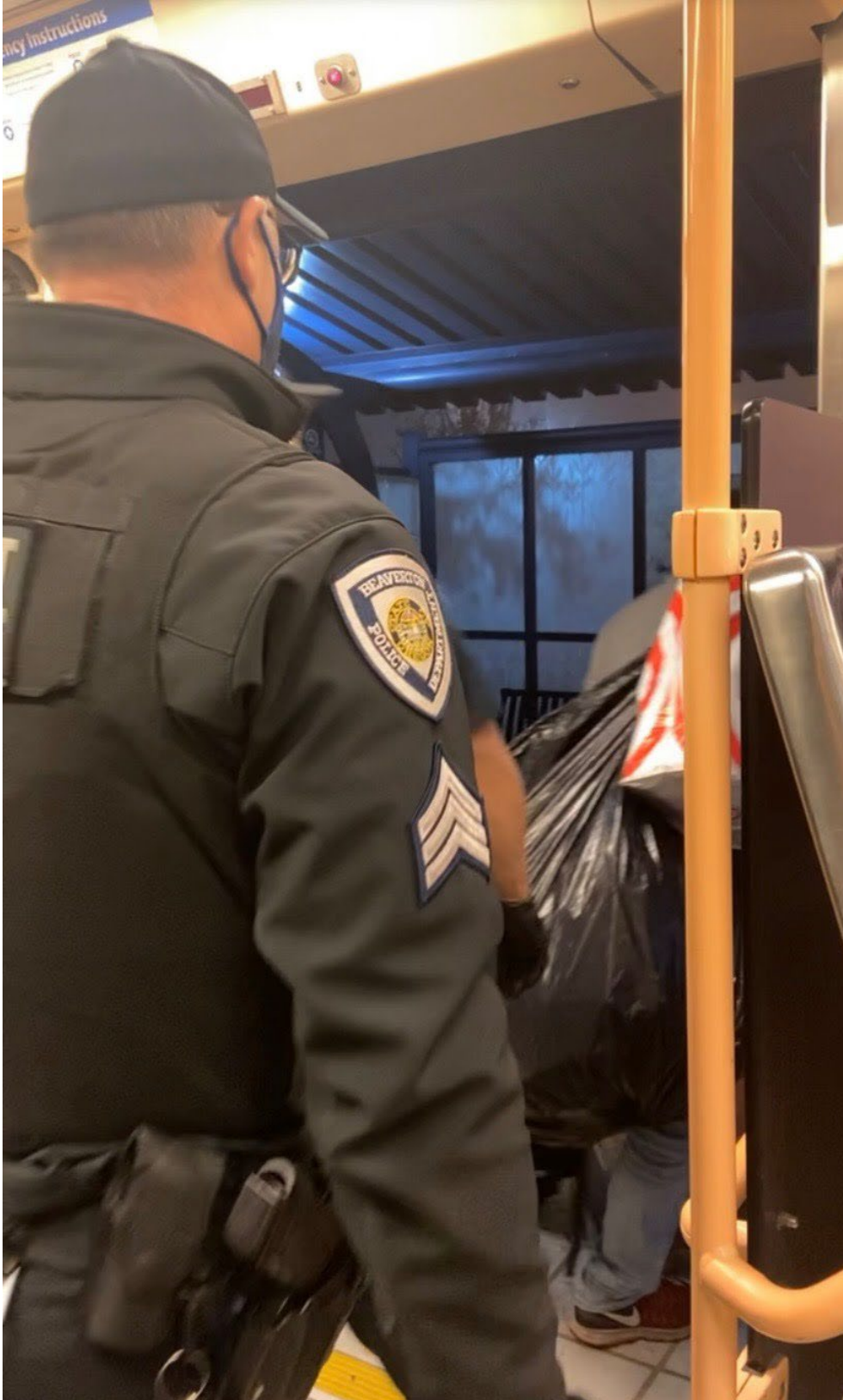
Figure 4: Police eject rider with bags of cans from train