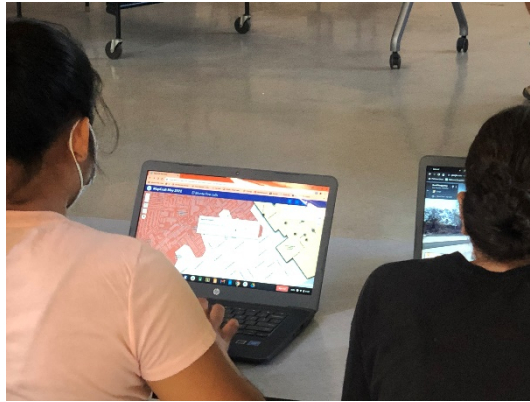
Figure 4. Bootcamp Days Two and Three