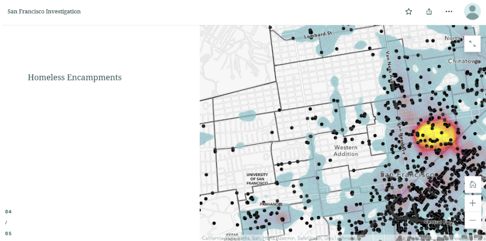
Figure 3. Screenshot from a Storymap Shown As Part of the Bootcamp

The individual sessions allowed the students to move from observation to application. O'Brien provided an overview of transportation careers in the first session so that the students were able to begin visualizing workplace applications of the transportation-related tools they were going to be using. Lead instructor Roberts began by presenting data on a map that showed community environmental hotspots which led to an exercise where students connected data to mapping tools as the first step in building a StoryMap.