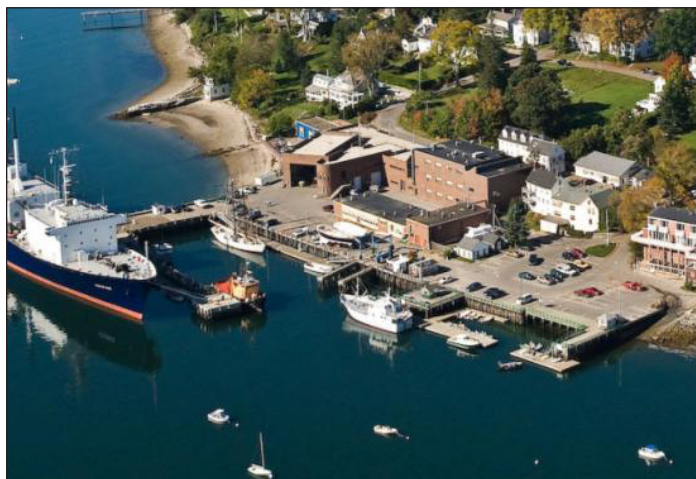
Maine Maritime Academy

The Marine Engine Testing and Emissions Laboratory (METEL) is a DOT University Transportation Center located at the Maine Maritime Academy (figure 1). METEL was developed to address environmental sustainability needs in transportation, primarily in the area of large-engine emissions such as those found in the marine, rail, and pipeline industries. In addition, the UTC is working on several initiatives to implement viable emissions reduction technologies for the marine industry.