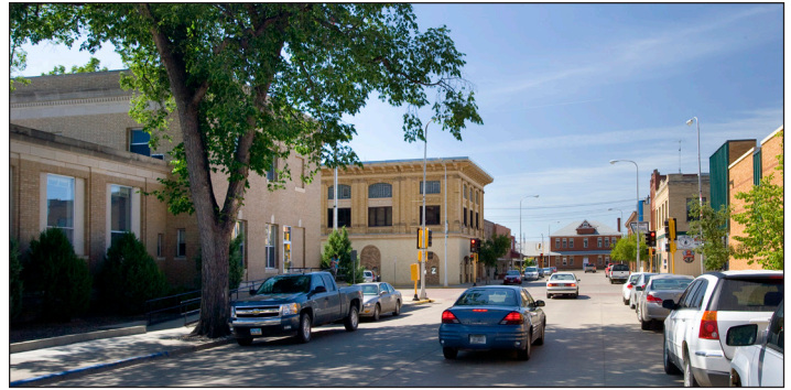
City of Dickinson, ND