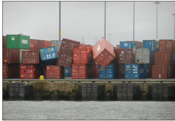
Figure 2: Port Damage

From a structural standpoint, Sandy had a relatively minor impact on the Port's waterside structures. Piers and wharves in large ports such as the Port of New York and New Jersey are typically designed to withstand horizontal impact loads from fully loaded ships and extreme vertical loads associated with containers and cargo handling equipment. While most of the waterside structures made it through the storm unscathed, there were many instances of wave and surge related damage to ancillary structures, equipment, and cargo throughout the port (figure 2).