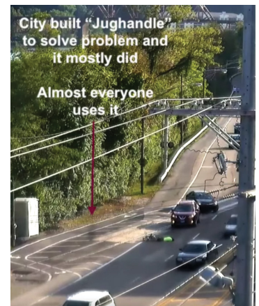
From their vantage point on the UTK campus, Cherry and his team photographed multiple crashes at a rail crossing when a jughandle crossing is not available or used.