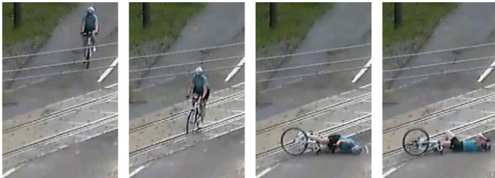
Biker unsuccessfully navigates rail crossing.