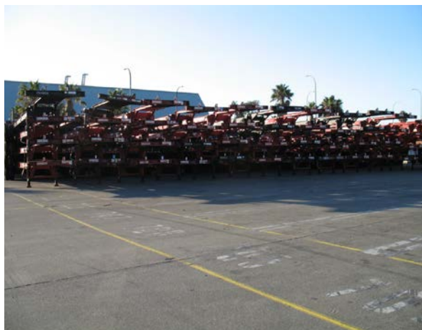
Figure 1: Chassis stored at container terminal

After conducting 17 interviews with stakeholders, the researchers were able to identify key themes. A major theme circulating throughout the interviews concerns the impact of labor agreements on chassis management. If chassis are owned and maintained by third parties but used at the ports, are they subject to contracts negotiated between longshore workers and marine terminal operators? If they are not subject to labor-managed inspections at the outgate, then there are potentially significant efficiency benefits for truckers as a result of improved turn times.