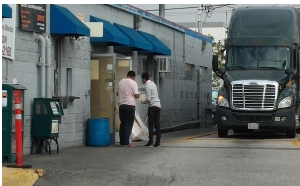
Figure 1. Field survey with truck drivers