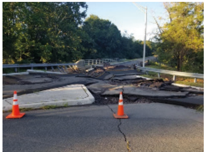
Figure 6. Example of roadway infrastructure damage caused by the storm in New Jersey

In addition to the emergency repairs, NJDOT had to tow abandoned vehicles that had been left on the roadway before roads could be reopened. NJDOT's quick response resulted in all interstates reopening within 12 hours of the storm, all major roads opening within 36 hours, and the entire system opening within 48 hours.