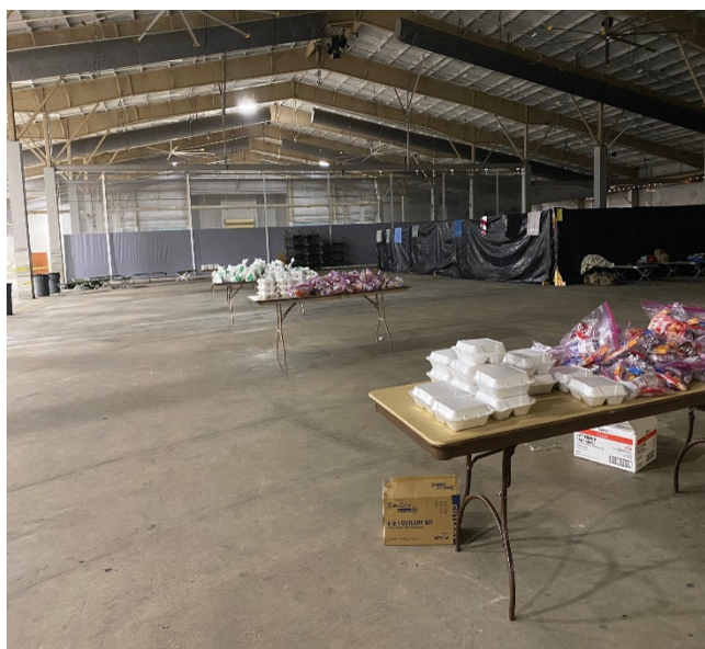
Figure 2. Lamar-Dixon Expo Center setup for hurricane evacuees

With Hurricane Ida on track to hit the two most populated cities in the State, Louisiana DOTD requested aid from other parts of the State to assist in the large response effort. Signal and sign repair personnel arrived from the northern part of the State to help restore functionality to critical signs and signals. Additionally, through the Emergency Management Assistance Compact (EMAC) process, 6 Louisiana DOTD worked with Texas DOT (TxDOT) to bring in TxDOT signal crews to backfill positions in Louisiana districts where there were not enough personnel to conduct routine maintenance.