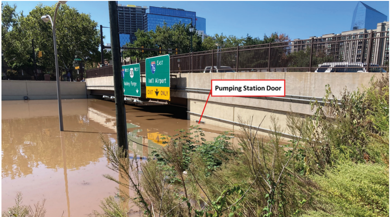
Figure 4. Pumping station along I-676 at 22nd Street in Philadelphia

The centrally located Area Command Center housed all PennDOT executive staff members and enabled them to make quick and timely decisions regarding the pumping