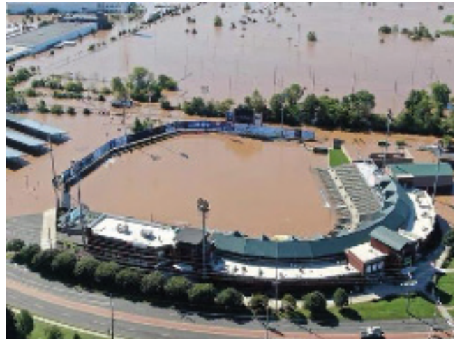
Figure 5. Somerset Patriots Stadium flooding

Although NJDOT personnel conducted extensive preparation for the storm, they were not expecting the Enhanced Fujita Scale rating 3 tornado produced by Hurricane Ida that hit Mullica Hill. The tornado destroyed several trees and homes. In response, Region South Operations mobilized several strike teams, composed of both DOT staff and contracting partners, to assist in debris removal in Gloucester County. A total of 890 truckloads of debris was removed. Shortly after the tornado touched ground, heavy rain began. The forecast was 6 inches of rain over 12 hours. Instead, New Jersey received 11 inches of rain in 6 hours. As a result, 42 locations required emergency infrastructure repair, with several locations needing a complete rebuilding of existing infrastructure. These locations were spread across 10 counties and 13 State highways.