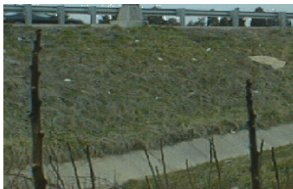
Concrete-lined drainage channel leading to a nearby drainage basin.

Heavy metals in highway runoff generally undergo physical, chemical, and biological transformations as they reach adjacent ecosystems. Sometimes, they are taken up by plants or animals, or adsorbed on clay particles. Other times, they settle to bottom sediments, or re-dissolve back into solution. Particulate fractions settling to the bottom surface of receiving waters may develop into sediments after several years of continuous deposition. These sediments may or may not leach metals depending on the condition and sensitivity of the receiving water. For example, chloride and acetate (from deicing chemicals) trigger the movement of metals that would otherwise remain in soil-ion exchange sites usually found in the first 20cm of the soil columns in sediments.