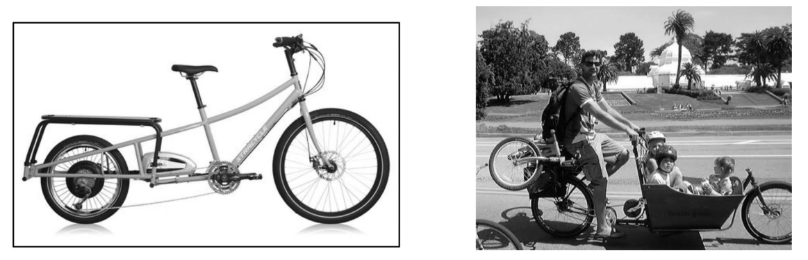
Figure 1. Edgerunner Xtracycle back loader electric bicycle (I) and Metrofiets (r) a frontloader electric bicycles.

California, United States who chose e-bikes, including ecargo bikes, over cars for daily commuting. Understanding how they have integrated e-bikes into their daily lives could provide ways to expand the e-bike market and strengthen policies that promote more sustainable modes of travel.