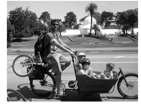
Figure 1. Edgerunner Xtracycle back loader electric bicycle (I) and Metrofiets (r) a frontloader electric bicycles.

California, United States who chose e-bikes, including ecargo bikes, over cars for daily commuting. Understanding how they have integrated e-bikes into their daily lives could provide ways to expand the e-bike market and strengthen policies that promote more sustainable modes of travel.