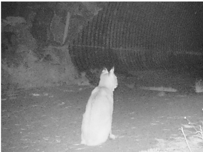
Figure 2: Bobcat contemplating a culvert under I-80.