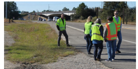
Multidisciplinary team performs field review during an RSA.

RSAs can be performed in any phase of project development, from planning through construction. Agencies may focus RSAs specifically on motorized vehicles, pedestrians, bicyclists, motorcyclists, or a combination of these roadway users. Agencies are encouraged to conduct an RSA at the earliest stage possible, as all roadway design options and alternatives are being explored.