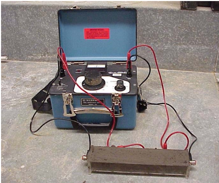
Figure 1. Nilson Resistivity Meter and Soil Box for Determination of Soil Resistivity

specific alternative water source? If so, what permit process should be followed? (b) Is there potential adverse effect on the health and safety of the public or the workers? (c) Is there potential for environmental damage from the use of alternative water? (d) How would the water composition impact material properties and performance of the constructed facility?