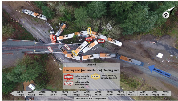
Figure 3 – Annotated aerial view of Dupont, WA, derailment scene captured by Washington State Police helicopter (National Transportation Safety Board 2019)

If it were common practice for first responders to capture drone imagery early in the incident response, the positions of key evidence could be established. Fortunately, more and more first responder agencies are acquiring drones, becoming well versed in their use, and are using them routinely as part of their incident response procedures.