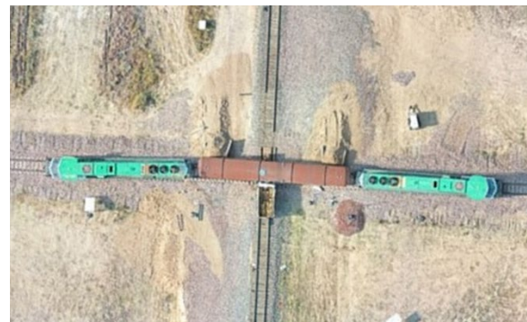
Figure 2 - Orthomosaic of highway-rail grade crossing impact test

Results indicate that the use of UAVs in accident reconstruction is quickly becoming a standard practice among State and even local police departments. Federal investigators, who often arrive a day or more after an incident, value the high quality orthomosaic imagery captured shortly after the event because the scene is often significantly changed during the search-and-rescue process.