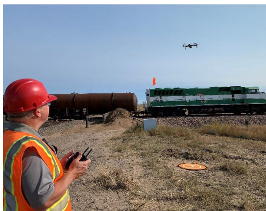
Figure 1 - Researcher using drone to capture accident scene imagery

In September 2021, RD&T conducted an impact test at the Transportation Technology Center (TTC) in Pueblo, CO, where a truck collided with a train. Volpe collected drone imagery of the post-crash scene in an effort to better understand what is involved in capturing the required incident data for a simulated highway-rail grade crossing environment. Figure 1 shows a Volpe researcher using a drone to capture aerial imagery from the accident scene.