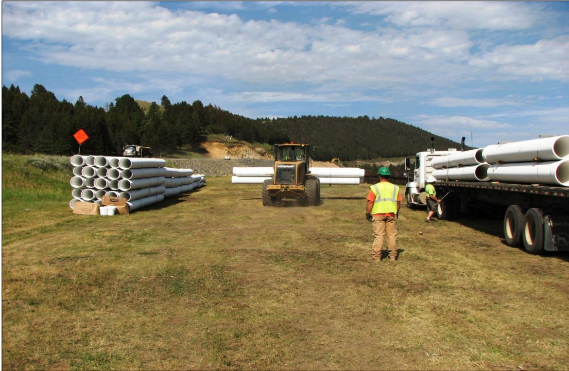
↕ Contech A-2000 pipe is delivered on-site.