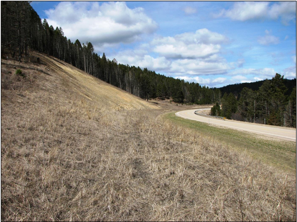
↑ View west: Start of approximate location at the east end of the 18" A-2000.