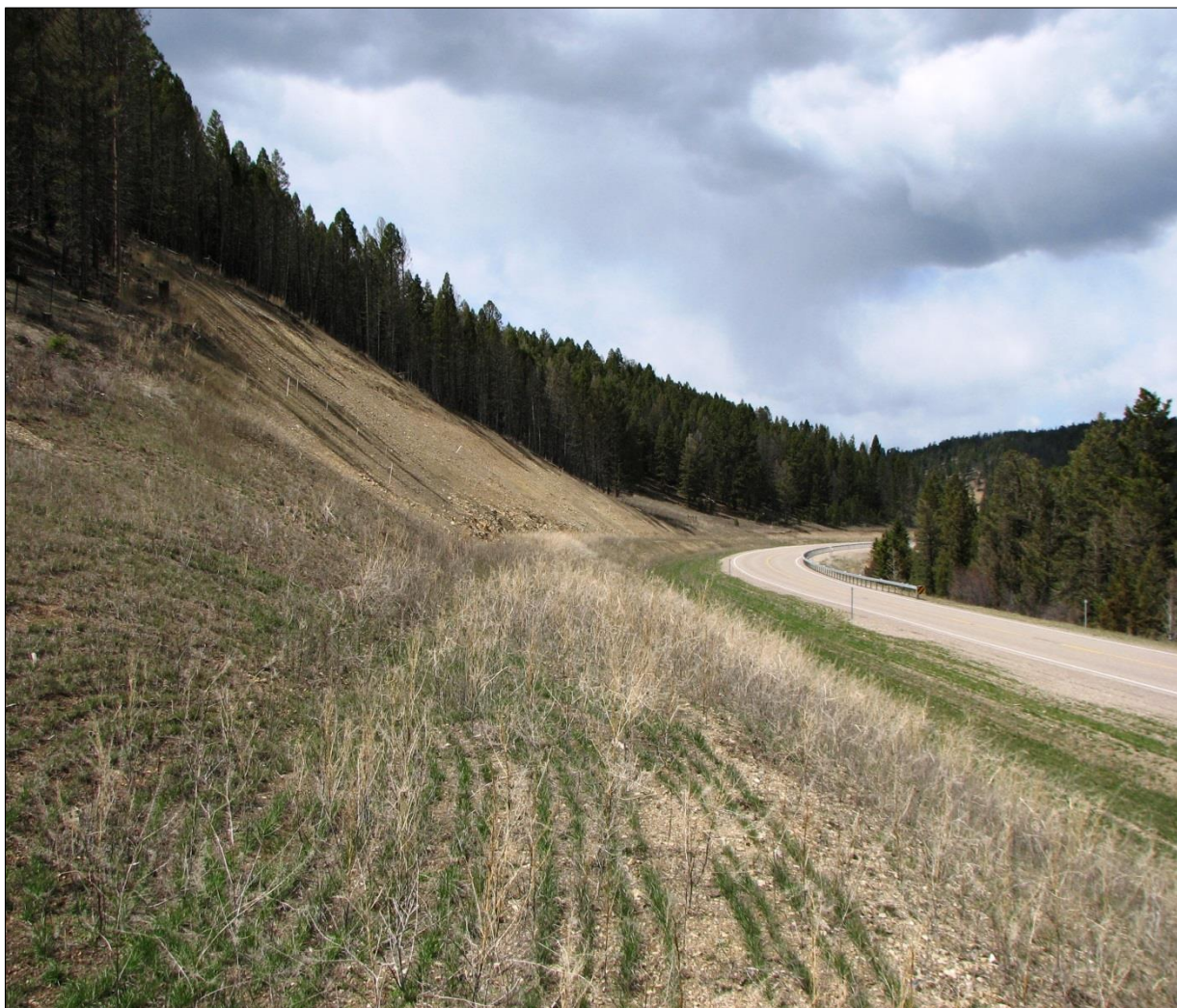
↑ View west: Start of approximate location at the east end of the 18" A-2000.