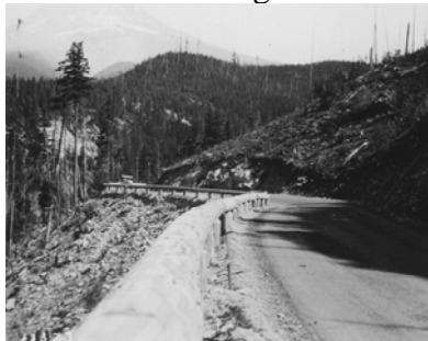
Mount Hood Highway, circa 1920’s, from WFLHD Photo Archives.

While they were doing the flagging, they came across an area where some of the trees were newer growth. “We flagged down the hill, and we came across...a column of trees that were shorter” than the trees on either side. The segment, about 40 feet wide, was a portion of the old wagon road, the Barlow Trail, where, he said, “they were later going to construct a turn-out.”