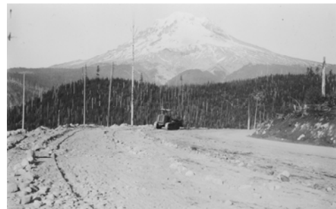
Mount Hood Highway, circa 1920's.

As late as the 1960's, portions of the Mount Hood Highway were narrow and crooked. Vern Ford worked on the reconstruction of the section from just east of Government Camp up to Bennett Pass during the 1967-1969 construction seasons. “When we got up on top of Barlow Pass and going on over to White River and Bennett Pass,” he said, “you were following the old road but widening it significantly and straightening it out. It was a really crooked one. There wasn't hardly a place...where two cars could pass – they were just real short tangents.”