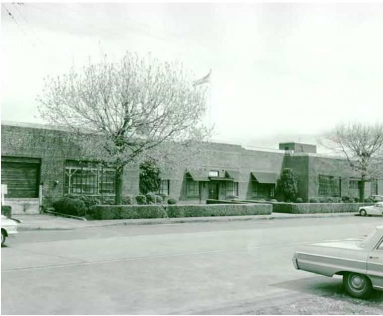
The south side of Building A along East Fifth Street, 1965. This building was later removed for the freeway.