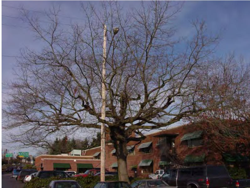
By 2006 "Building A" was long since gone, but the tree remained. It, too, has since been removed.