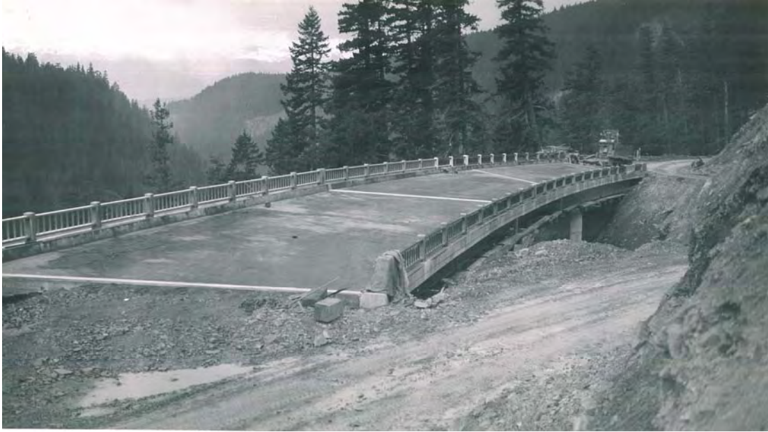
A bridge on the White Pass Highway, circa 1952.