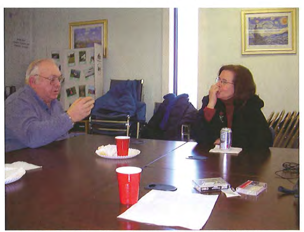
Attendees at St. Albans group interview at the St. Albans RPC offices.

Findings indicate that Vermonters interviewed believe public transportation is a critical transportation mode to emphasize as the state develops its long range transportation plan. One narrative that emerged from Vermonters' views of the state's transportation future emphasized a transportation policy incorporating a fix it first approach. A second narrative that emerged, energy collapse , sees energy and climate change issues as having a major impact on Vermont's transportation future.