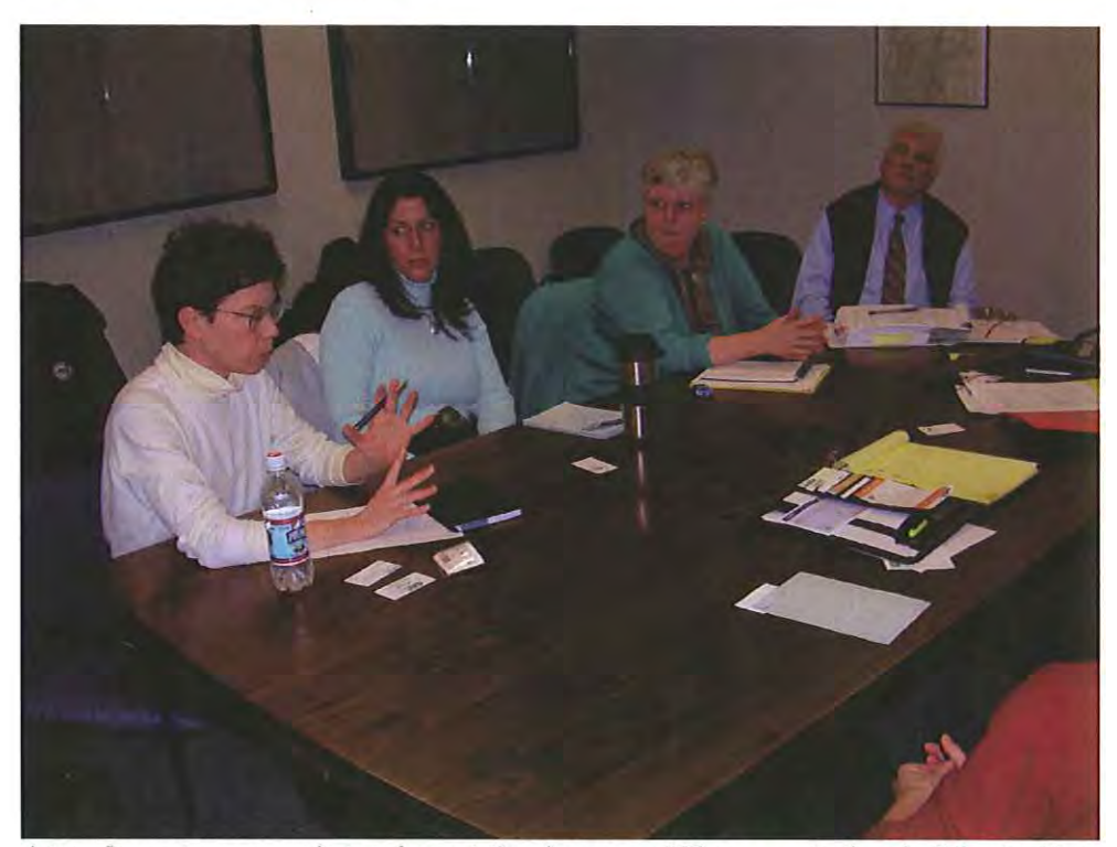
Attendees at a group interview at the Agency of Transportation in Montpelier.

In a series of public meetings in 1998, maintenance first and increased investment in public transportation were the top two issues raised by attendees (1998 Transportation Public Forums Final Report).