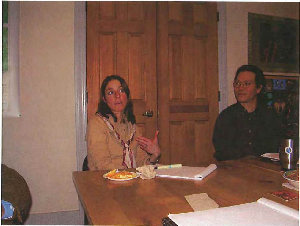
Attendees at a group interview in Montpelier.

There are four appendices attached to this report which provide a list of interviewees, interview questions, code descriptions and the comments from interviewees.