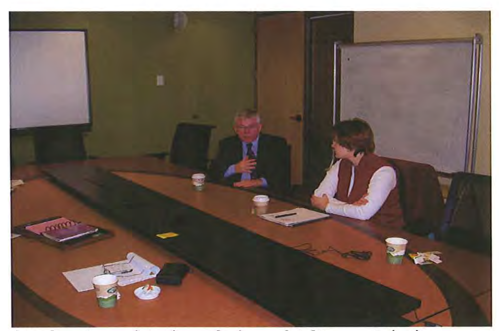
Attendees at group interview on business related transportation issues.

You're going to have a lot of people who are going to be unable to drive in a pretty short time span. And if you're going to continue to have a policy of aging in place then you're going to have to begin to address those needs. But one of the other things is it's not just that people who are unable to drive and are needy because they need medical care, this is also a generation who is expected to be relatively active as well — and they want to go out and they want to socialize and they don't want to be isolated and one of the ways that people can avoid isolation is to have transportation.