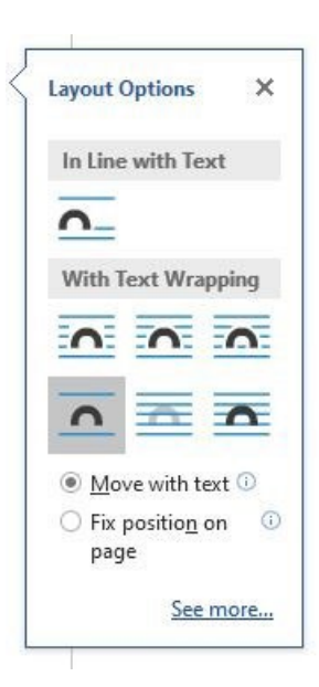
Figure 1. Choose layout in lower left

The example in Figure 3 is similar in appearance to typical figures in FAA reports.