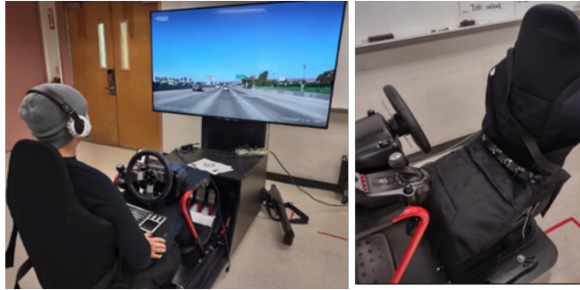
Figure 2. Experimental Setup and Apparatus

Twenty piezo-buzzers (or C-2 tactors; shown as the numbered circles on the seat and seat belt in Fig. 3) sent tactile signals. In total, six signal types (Table 1) were presented: navigational (left turn, right turn, U-turn), speed (speed up/slow down), surrounding vehicle location (left, behind, right) and status, over the speed limit, headway reductions (forward collision), and pedestrian status (traveling left-to-right or right-to-left). Fig. 3 shows example patterns.