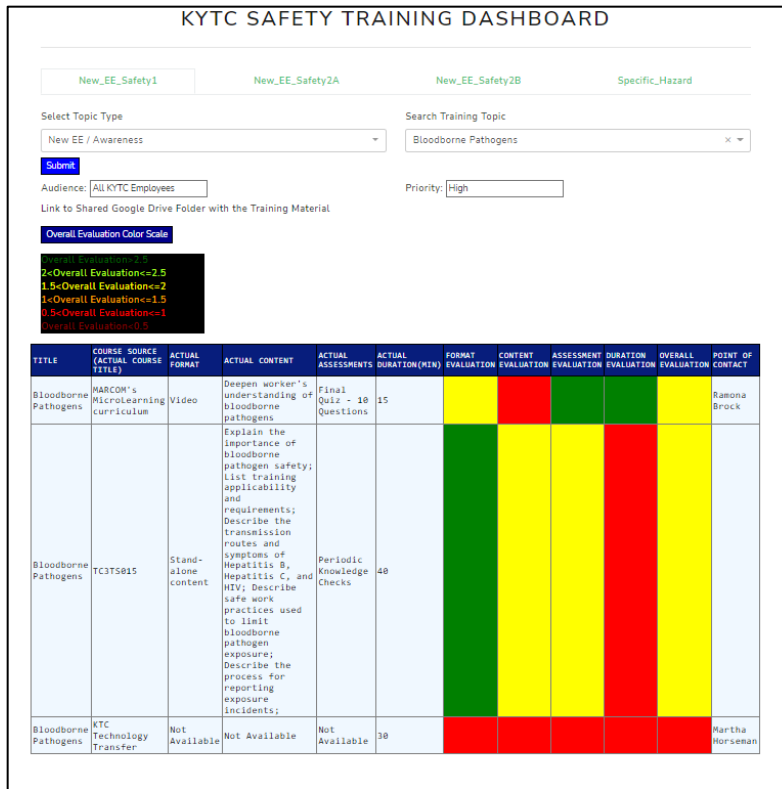
Figure 3.5 KYTC Safety Training Dashboard User Interface Webtool (Course Evaluation Table)