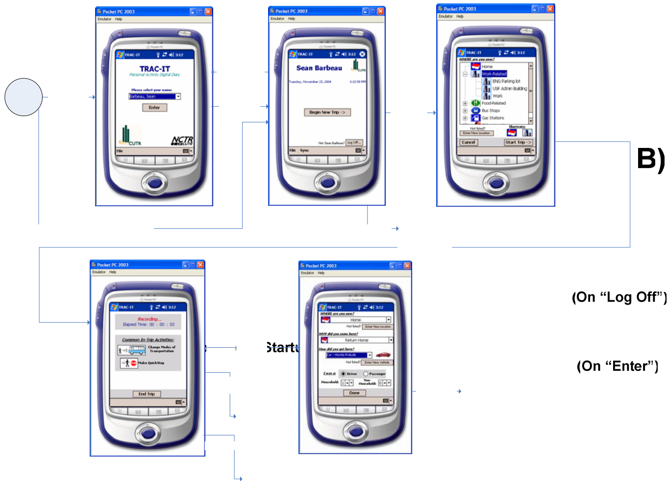
Figure 2: TRAC-IT® User Interface