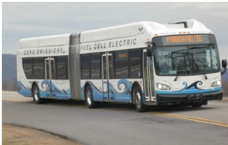
Figure 5-1 XHE60 Bus at Altoona Test Track

New Flyer shipped the XHE60 bus to Altoona in July 2016 for performance and durability testing. Numerous delays were experienced with obtaining on-site hydrogen infrastructure; as a result, no hydrogen fueling capability was under contract until the last quarter of 2016, and the test center experienced a significant delay getting the hydrogen fuel station up and running. The bus completed check-in and jacking and hoisting testing, but durability testing did not start as planned because of the lack of fuel. Fuel arrived early November 2016. With project slips and the fueling delay, the project was behind schedule by 12 months.