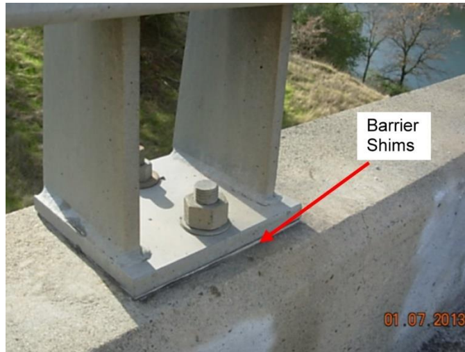
Figure 2.2 Barrier rail shims with ACM (Caltrans 2013)