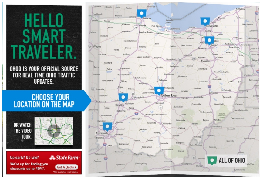
Figure 3. Ohio traveler information website featuring State Farm advertisement