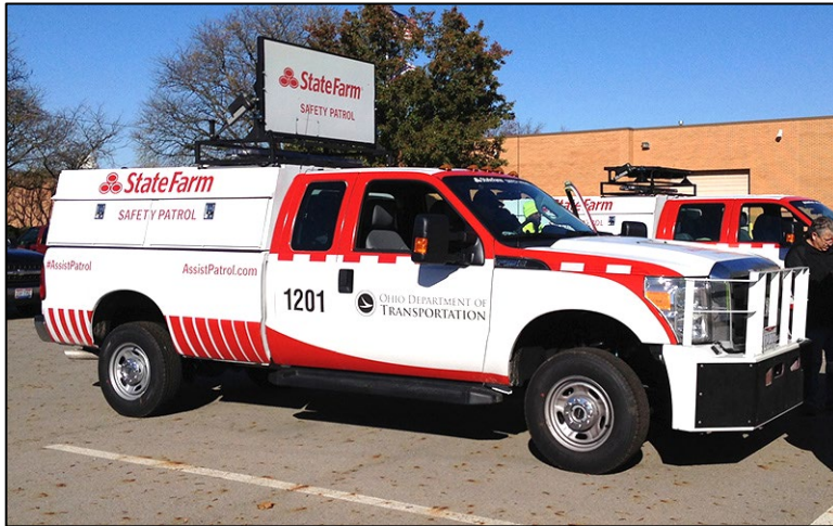
Figure 2. State Farm Safety Patrol vehicles