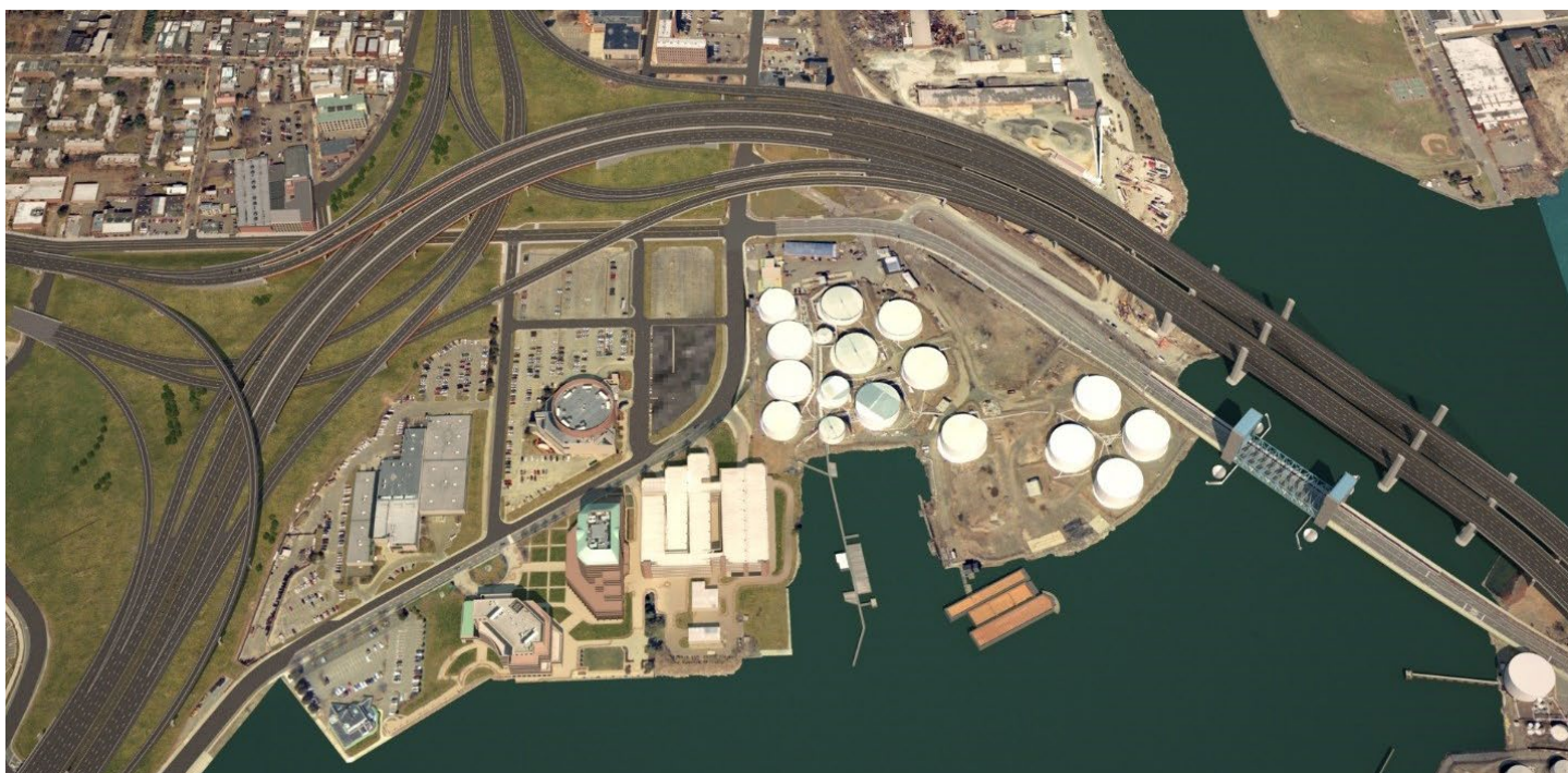
Figure 2: Rendering of Proposed Reconstruction of the I-95/I-91/Route 34 Interchange (I-95 Harbor Crossing) 2

The I-95 New Haven Harbor Crossing Corridor Improvement Program is a multi-year, multimodal transportation project that started in 2000 and was substantially complete by November 2016. The program used a total of 28 construction contracts to complete various phases of the project, including public transit enhancements, highway capacity improvements, and replacement of the Pearl Harbor Memorial Bridge that spans the Quinnipiac River (locally known as the Q Bridge).