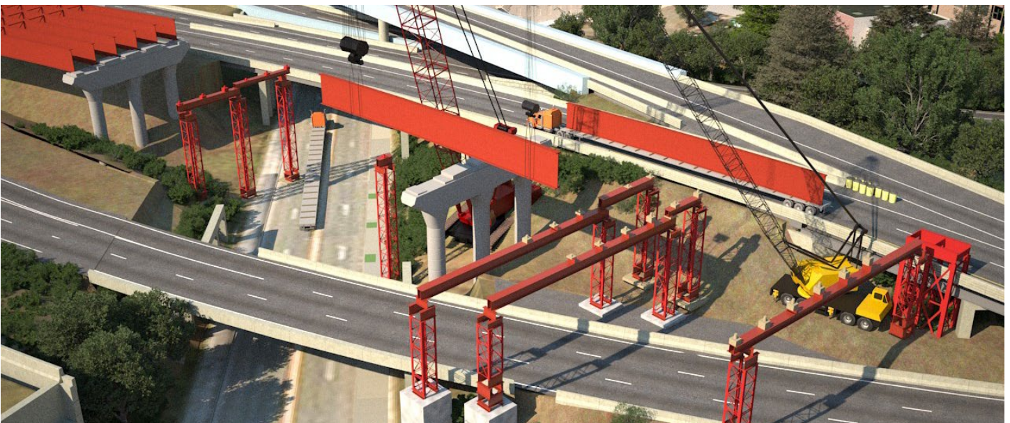
Figure 1: A 3D Rendering Showing the Complex Erection Sequence for an Overpass in the I-95 New Haven Harbor Crossing Corridor Improvement Program. 1

Bidders interpret the design intent directly from the contract documents published during the project's advertisement. The contract documents are traditionally based on two-dimensional (2D) construction plans and specifications, which often lack the level of communication necessary to explain the design intent. This communication approach leaves the contractor to assume a level of risk when preparing a bid and planning the construction means and methods. These assumed risks can be costly, but more importantly, they become the owner's to bear as the project moves on to construction.