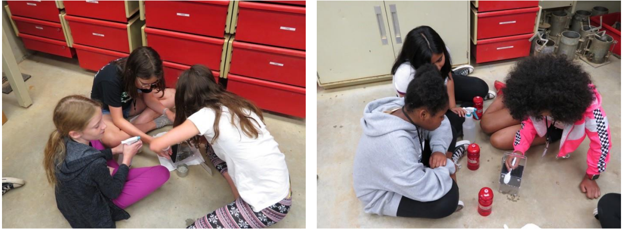
Figure 7. Photographs of 4 th and 5 th grade girls completing a hands-on experience with plastic panel dams during the GirlTREC summer program (July 9, 2019).

Butterfield, older students were paired with younger students; the plastic panel dam may have been too advanced for some of the first graders. The third program to use the plastic panel dams was the Village of Promise on September 25, 2019 (Figure 11). Fifth graders are an ideal target audience.