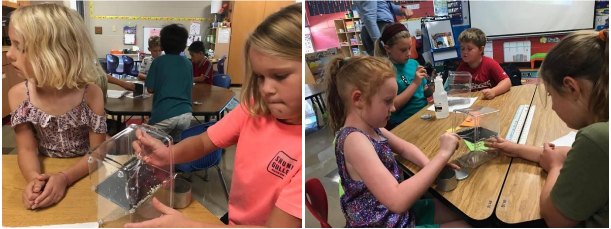
Figure 9. Photographs of 1 st through 4 th grade students completing a hands-on experience with the plastic panel dams during the Butterfield Elementary School Science Club (September 9, 2019).