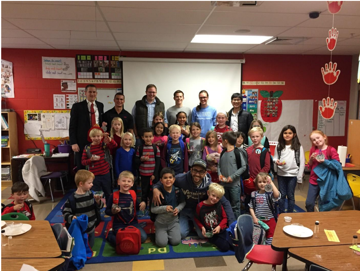
Figure 5. Photograph of the Butterfield Elementary School students and University of Arkansas mentors as part of the Butterfield Elementary Science Club demonstration on fluorescent soils.