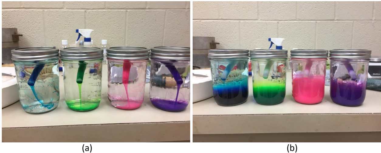
Figure 2. Photographs of highlighter cartridges in bell jars, a) immediately after placement of the cartridge into the Kerr jar, and b) after the cartridge has been in the Kerr jar for 24 hours.