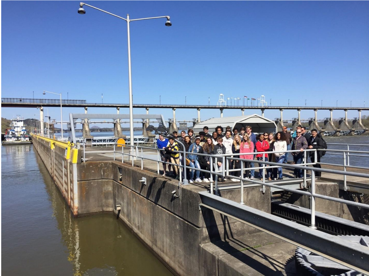
Figure 13. Photographs of the 9 th through 12 th grade students touring the Murray Lock and Dam with the Little Rock District of the United States Army Corps of Engineers on April 2, 2019.