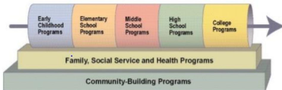
Figure 1. HCZ pipeline model (HCZ Website, 2018).

this project was similar to the successful Harlem Children's Zone (HCZ) pipeline model that is shown in Figure 1.