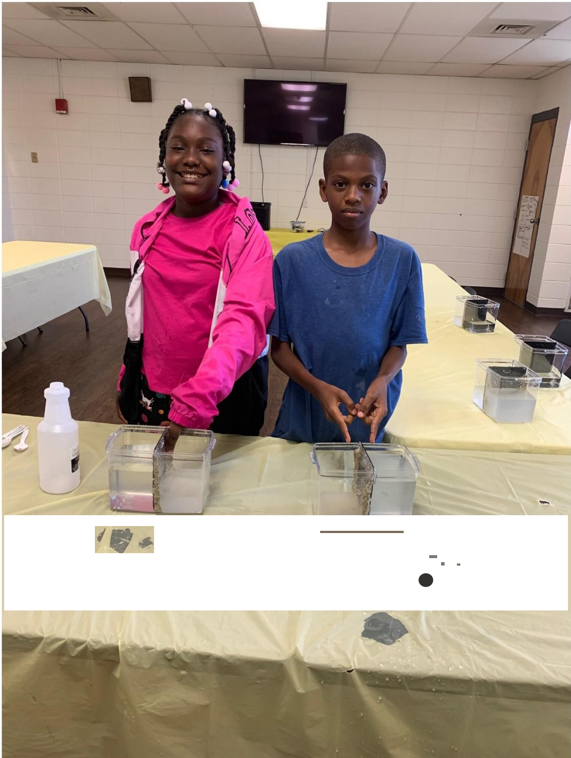
Figure 11. Photographs of 5 th grade students at the Village of Promise completing a hands-on experience with the plastic panel dam prior to the field trip to Guntersville Dam (September 9, 2019).