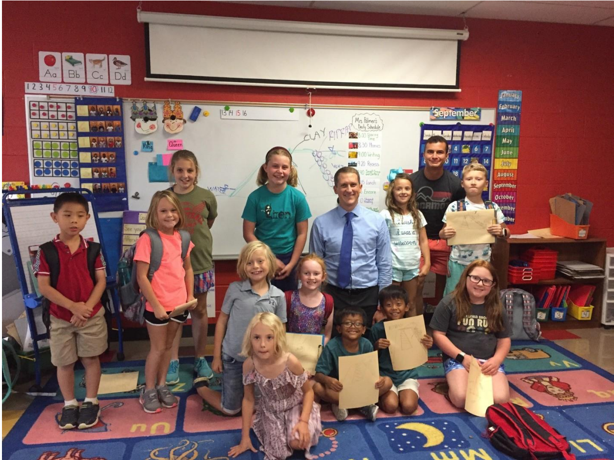
Figure 10. Photographs of 1 st through 4 th grade students completing a hands-on experience during the Butterfield Elementary School Science Club (September 9, 2019). Students shown holding drawings of clay core dams.