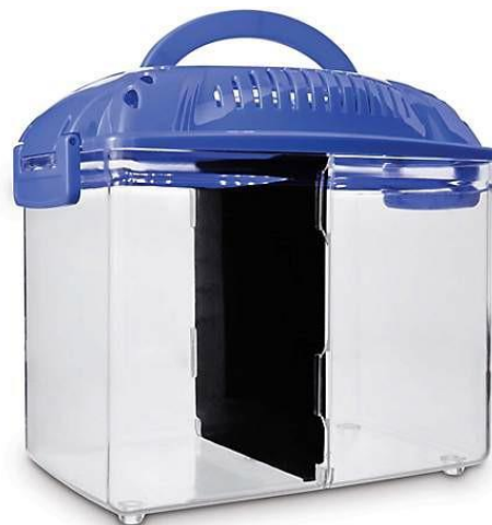
Figure 3. Betta fish dual habitat fish tank, obtained from Petco, and used as a small-scale panel dam (Petco, 2019).

Small-scale plastic panel dams were constructed using 0.8 gallon Imagitarium Betta Fish dual habitat fish tanks that were purchased from Petco (Figure 3). These small-scale dams were initially used for the GirlTREC outreach efforts (4 th and 5 th graders) on July 9, 2019, then were reused for the Butterfield Elementary School outreach efforts (1 st -4 th graders) on September 9, 2019, and then were reused again for the Village of Promise