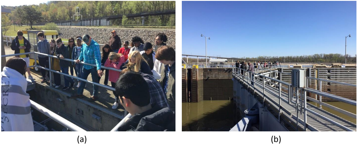
Figure 12. Photographs of the 9 th through 12 th grade students touring the Murray Lock and Dam with the Little Rock District of the United States Army Corps of Engineers on April 2, 2019.

As described in Section 3.4, students from Little Rock Central High School STEM club were provided with the opportunity to tour the Murray Lock and Dam. Photographs from the site visit are included in this section. As previously mentioned, a second tour of the Murray Lock and Dam with the Little Rock Central High School AVID program was attempted but was not able to be arranged due to scheduling constraints.