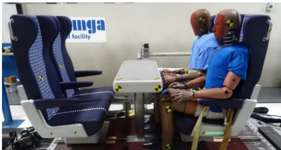
Figure 1. Pre-test Photo of a Workstation Table

Figure 1 shows the pre-test setup of an S-018 sled test. The sled test evaluates the structural integrity of passenger railcar interior equipment, compartmentalization of occupant ATDs, the energy absorption capabilities of crashworthy workstation tables, and the injury criteria resulting from simulated collision conditions.