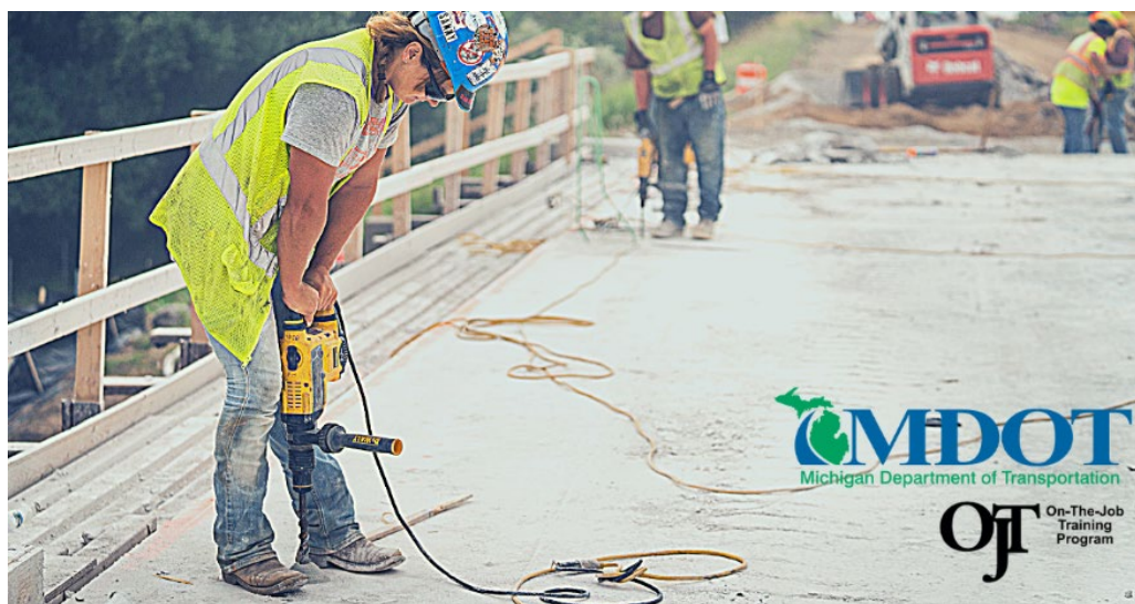
MDOT runs ads throughout Michigan to promote the OJT program.