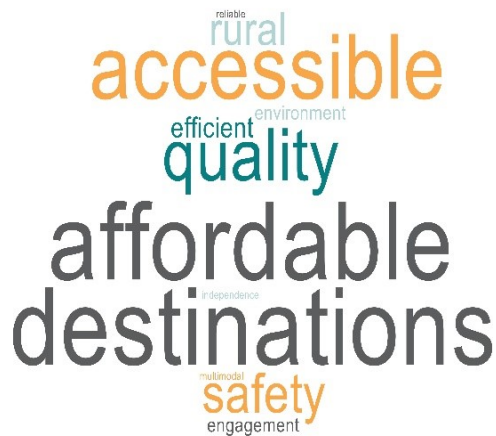
Figure 4.2: Transportation equity key words identified by stakeholders and community members

As we discussed in Chapter 2, equity is a prominent concept in transportation scholarship, and it is a concept that can be defined in a variety of ways. Policy makers who are interested in promoting transportation equity often need to clarify and define what constitutes equity. Prior to developing a definition for transportation equity, we asked the Transportation Users/Equity Stakeholders Group what transportation equity meant to them and then used their input as well as what we learned from the literature and current practice review to create a draft definition. Based on community feedback, we identified the following key words that characterize what transportation equity meant to community members (See Figure 2).