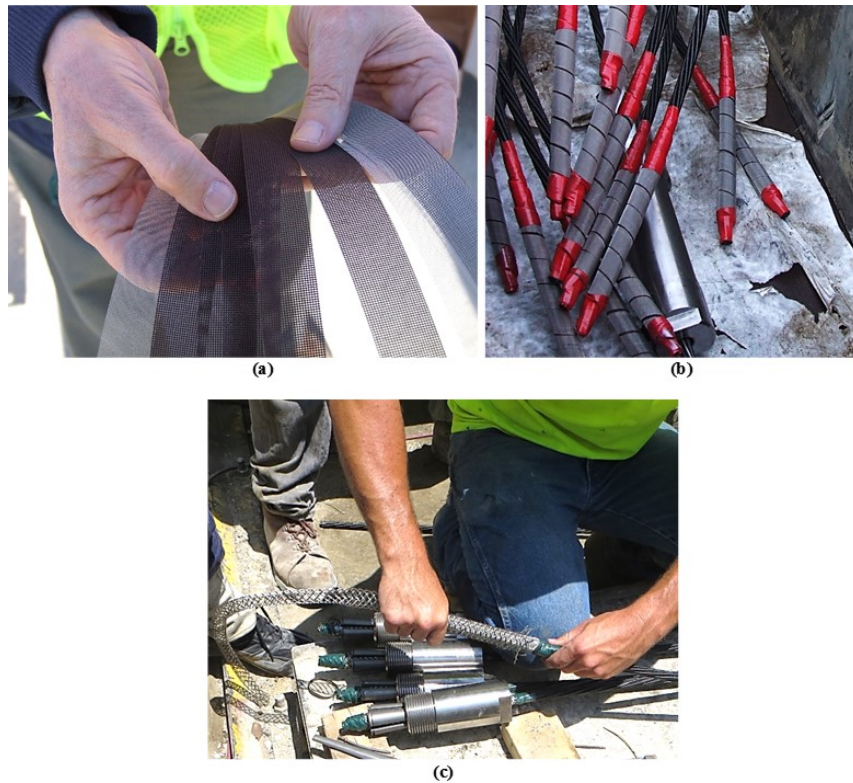
Figure 5. CFRP End Preparation for Tensioning Using Coupler. This requires (a) layered mesh sheets (b) to be wrapped around CFRP and taped (gray helical wrapping with red tape along the edge of the mesh sheet) and then (c) a braided grip to be slid over the mesh sheets and also taped. CFRP = carbon fiber reinforced polymer.