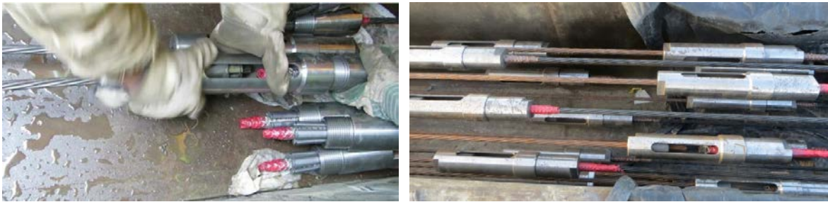
Figure 4. Carbon Fiber Composite Cable and Steel Couplers Joined (left); Couplers Staggered and Tensioned (right)

However, special handling requirements are necessary for the preparation of CFRP ends for stressing. Jacks do not directly grip and pull the end of the CFRP. Instead, steel strands are attached to CFRP strand by a coupler (Figure 4), and jacks then grip and pull the steel strands. To couple the steel and CFRP strand, the steel strand was placed in one-half of the coupler with a traditional chuck to secure it and the CFRP was prepared with special buffer materials and placed in the other end of the coupler. The CFRP end was prepared for the coupler by wrapping it with a mesh sheet made of layers of metal and plastic, followed by insertion of the wrapped end into a braided stainless steel grip, as shown in Figure 5. The prepared end was held by four-part wedges evenly inserted in a chuck barrel. Because of the time required for end preparation, daily cycles for the production of CFRP piles were not achieved, although conventional piles were prepared and detensioned in a 24-hour cycle.