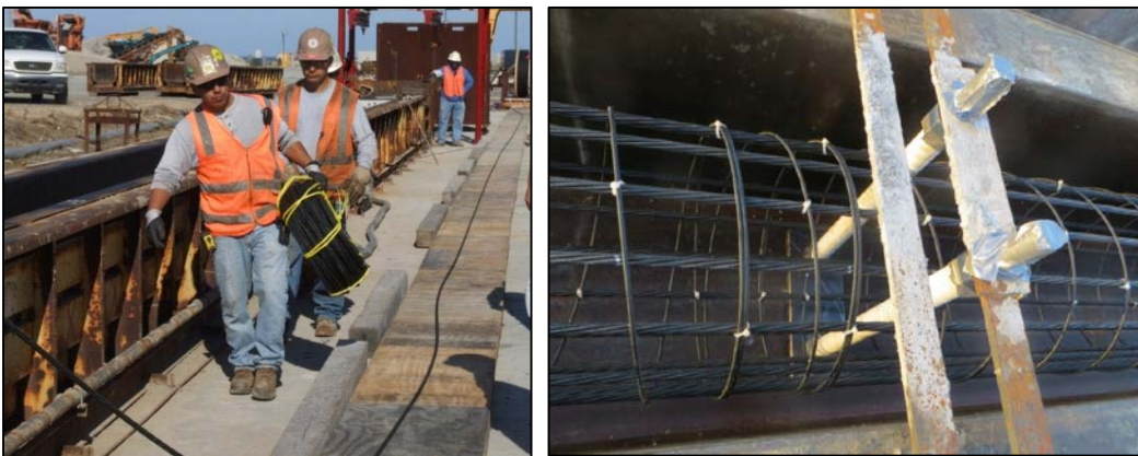
Figure 6. Spiral for Pile Carried by One Person ( left ); Lifting Device ( right )

Corrugated plastic pipe was used at the head of the pile where dowels are placed for connection to the pile bent. The plastic prevented contact between the conventional steel reinforcement in the pile caps and the CFRP, which could have created a galvanic cell between the reinforcing steel and the CFRP. This precaution was taken although the CFRP wires are coated with a thin layer of polyester tape that maintains the round shape of each wire. Although the polyester tape should prevent galvanic interaction, the use of the plastic pipe eliminated the possibility of contact between the steel and CFRP strand, and it also ensures that the CFRP strand is protected from abrasion damage during subsequent construction activities.