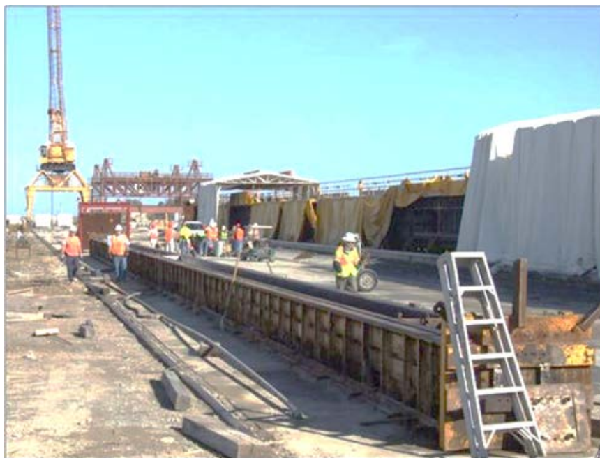
Figure 3. Pile With Carbon Fiber Reinforced Polymer at Casting Yard

The CFRP used in this project, carbon fiber composite cable, is a carbon fiber, derived from polyacrylonitrile, with an amine-cured epoxy matrix. It has low ductility and is anisotropic, resulting in high strength in the axial direction, but the strength decreases as the applied force rotates toward the transverse direction. CFRP can also burn, so CFRP can be cut using an angle grinder with an abrasive cutting blade rather than an oxy-fuel torch. Further, careful handling is required to avoid abrading or nicking the CFRP strand. These characteristics of CFRP still allowed all of the CFRP piles to be cast at a precaster's facility using the same prestressing equipment and concrete that is used to fabricate conventional steel reinforced piles (Figure 3).