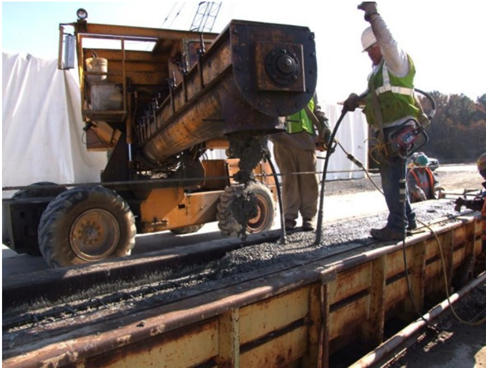
Figure 7. Concrete Consolidation Using Rubber Tipped Vibrators

A thermocouple inserted at a depth of 2 in inside the concrete surface monitored the test pile temperature during steam curing. Another thermocouple was placed in the enclosure at each end of the bed. Although the concrete temperature reached 135 °F (lower than the allowable 180 °F), near the couplers the temperature remained well below 122 °F, which deterred slipping of the CFRP strands in the coupler. The specified minimum release strength of 3,500 psi was achieved overnight. The CFRP piles were then ready for detensioning and removal from the bed.