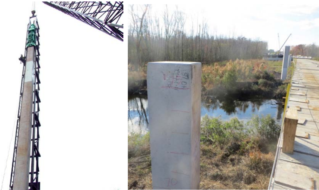
Figure 8. Preparing for Pile Driving (left); Pile in Place after Driving Showing No Signs of Damage to Upper Portion of Pile (right)

Two CFRP-reinforced piles were driven as test piles along with other traditional steel reinforced test piles during the construction of the Nimmo Parkway Bridge (Figure 8). During driving, the ram weight was 10,141 lb and the hammer stroke was 5.7 to 9.2 ft. The dynamic analysis indicated that there were no differences in the driving responses of piles with CFRP and conventional piles with steel strands. (Later, the 16 CFRP production piles were also driven with no problems.) The reduced elongation of CFRP compared to the ASTM requirement of a minimum of 3.5 percent elongation did not compromise the driving operation. The test piles demonstrated that although CFRP requires special end preparation (Figure 5) and some handling accommodations (Figures 6 and 7), a CFRP-reinforced pile can be driven in the same way as a pile with conventional steel strands.