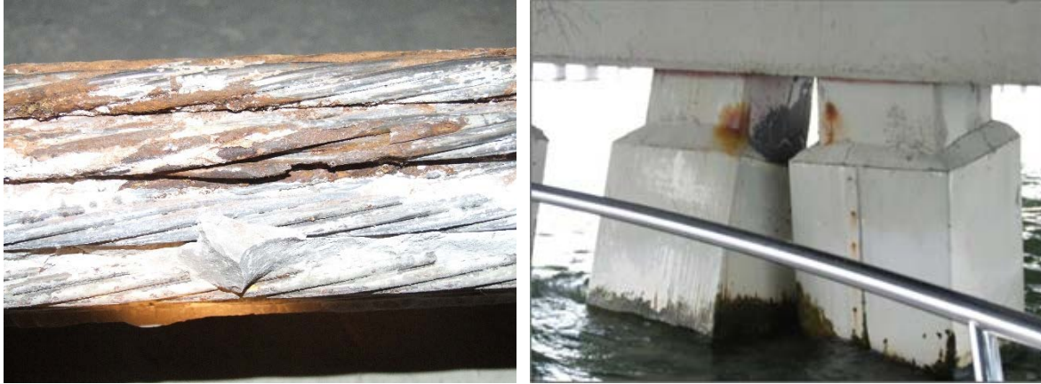
Figure 1. Corrosive Attack in Section of an External Steel Tendon After 17 Years (left); Corroding Piles, With Oldest Piles Being Driven in Late 1950s Requiring Repair by Early 1980s (right) 3

As reported by Hartt et al., the use of fiberglass jackets as a stand-alone repair was found to hide corrosion damage under the flexible fiberglass jacket. 2 Hartt et al. also demonstrated that once corrosion begins to degrade a bridge element, future repairs in the vicinity of the original damage will most likely follow. For piles, this is of great concern since repairs are costly and difficult because these elements generally are load-carrying members under the deck. In many cases, traffic must be interrupted with lane closures and work zones that limit traffic flow and increase traffic hazards. In heavily traveled structures, the cost of traffic controls and repairs can easily approach a significant percentage of the cost of building a new structure in addition to being very inconvenient to the traveling public. Bridge structures are expected to last at least 75 years and preferably 100 years. Therefore, it is critical that the reinforced concrete piles be designed with materials that resist corrosion or are corrosion free so that the piles will reach the intended design life with minimum, if any, disruptions of traffic flow because of corrosion mitigation.