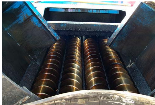
Photo 19. Auger system within the Novapaver.

The screed of the paver is fully adjustable and is heated electrically. The screed is set to a temperature and maintained with a thermostat control. Typically, the screed is preheated prior to the paving operation. The paver uses a series of augers (Photo 19) that are placed in the hopper of the paver parallel to the centerline of the paver. There did not appear to be segregation in the delivery of the asphalt from the truck to laydown. The NovaChip® paver placed the asphalt at nearly 65 to 75 feet per minute (0.74 to 0.85 lane miles per hour).