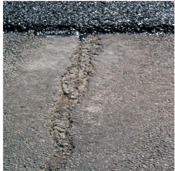
Photo 10. NovaChip® asphalt placed over existing cracks. These transverse cracks should have been sealed prior to the NovaChip®.

The existing curb condition through Soap Lake consisted of concrete curb and gutter. The previous BST had been placed adjacent to the concrete gutter causing a build up of asphalt material. The placement of the NovaChip® drastically increased the channel flow condition that previously existed, as is shown in photos 11 and 12. In retrospect, the existing roadway should have been milled so that the overlay would match with the curb and gutter.