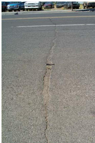
Photo 5. Medium to high severity transverse crack seen on SR 17. Cracks of this width should be crack sealed prior to overlay.