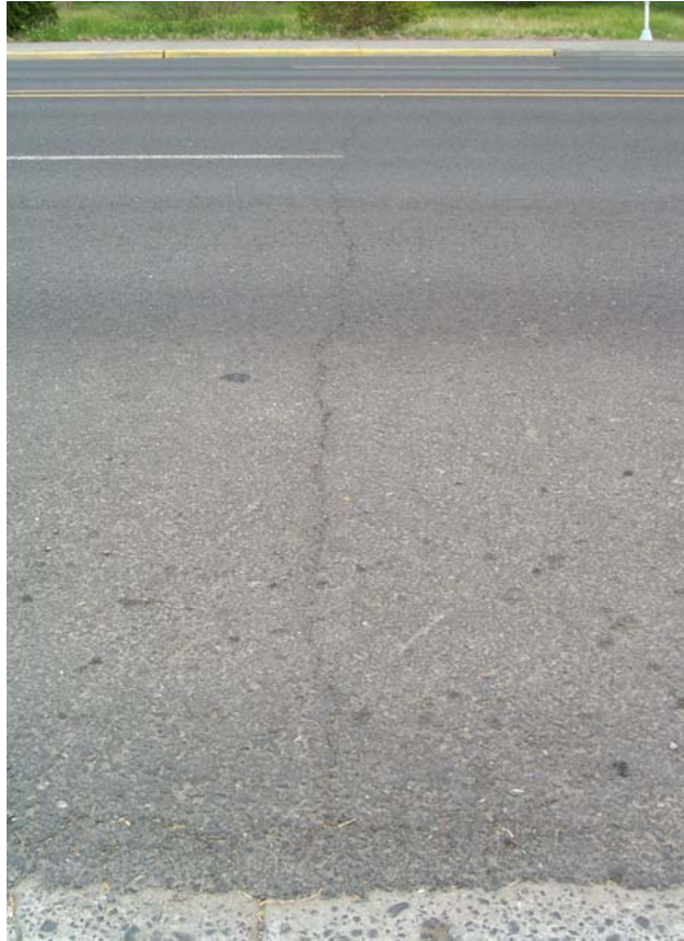
Photo 27. Transverse crack reflecting through the NovaChip® overlay.