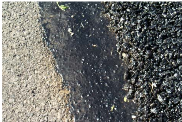
Photo 18. Novabond® Membrane placed outside the hot mix asphalt indicates its heavy thickness.

As a way to measure the upward absorption of the NovaChip® in the hot mix asphalt, Frank Bonwell, WSDOT project inspector, devised a method where a 6-inch by 6 inch section of roadway was removed and the depth of absorption was measured with a tape measure. With a physical measurement, the adjustment to the proper application rate was easily made.