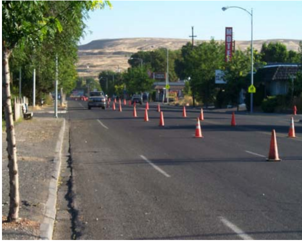
Photo 13. Traffic control in place.