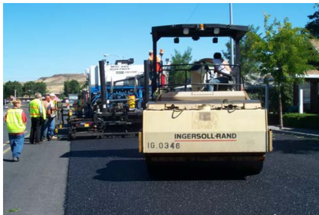
Photo 20. Rolling directly behind the NovaChip® paver with a 15 ton roller.

The NovaChip® asphalt was seated into the Novabond® membrane by using one 15-ton roller for the initial breakdown and one 12-ton roller to finish the surface. Rollers were operated only in the static mode as is the recommendation for NovaChip®. Additional rolling occurred to remove remaining roller marks. Koch reported that rolling typically occurs between 195-285°F and is determined by trial and error. In Soap Lake, compaction was attempted immediately after NovaChip® placement, however, rollers “picked” material off the mat. By delaying the initial breakdown rolling until the mat temperature was approximately 230°F (3 to 4 minute delay), picking was not a problem. Cross traffic was allowed on the NovaChip® surface anywhere from 10 to 20 minutes behind initial placement. Compaction photos are shown below.