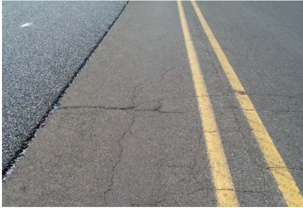
Photo 7. NovaChip® placed over existing roadway. (The existing low severity cracks were not sealed.)