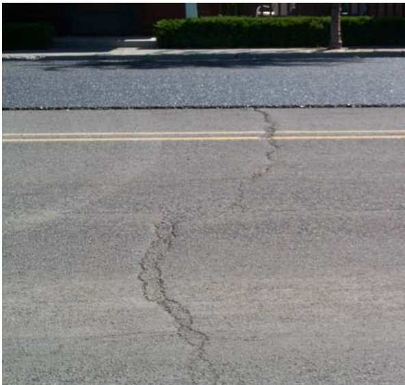
Photo 9. NovaChip® placed over an existing transverse crack (high severity).