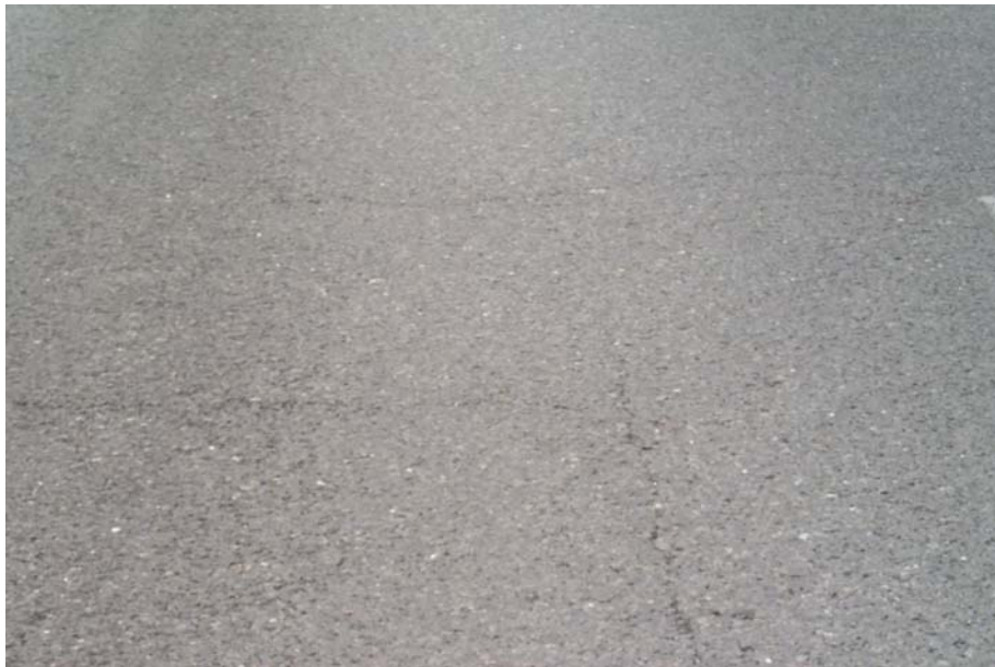
Photo 28. Block Cracking reflecting through the NovaChip® overlay.