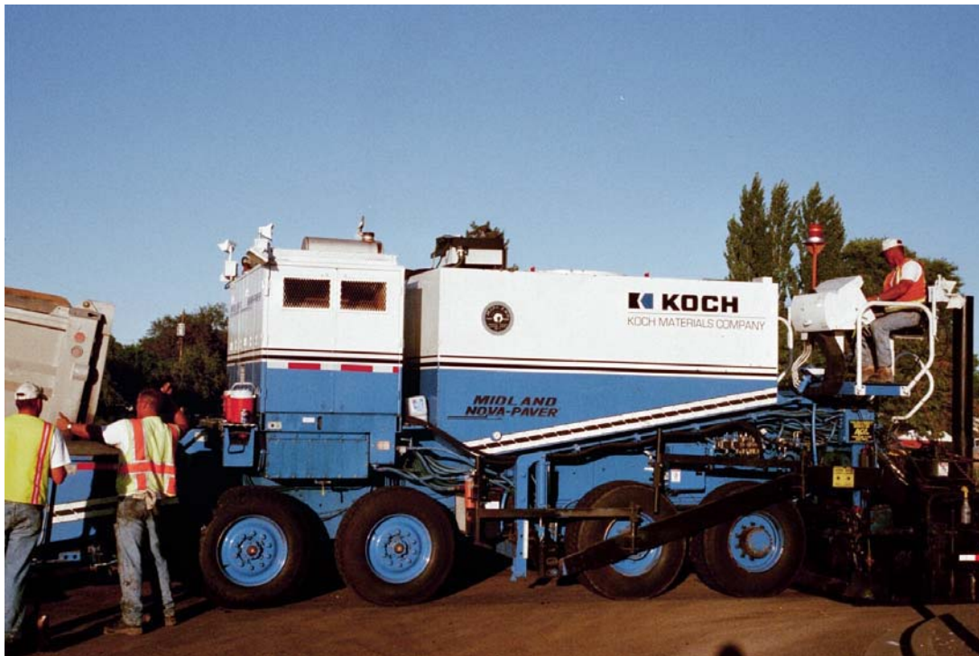
Photo 1. Novachip Paving Machine.

NovaChip® placement utilizes a single piece of specially designed equipment that places the NovaChip® surfacing and Novabond® membrane in a single pass. The Novapaver and its basic components are shown in Photo 1 and Figure 1.