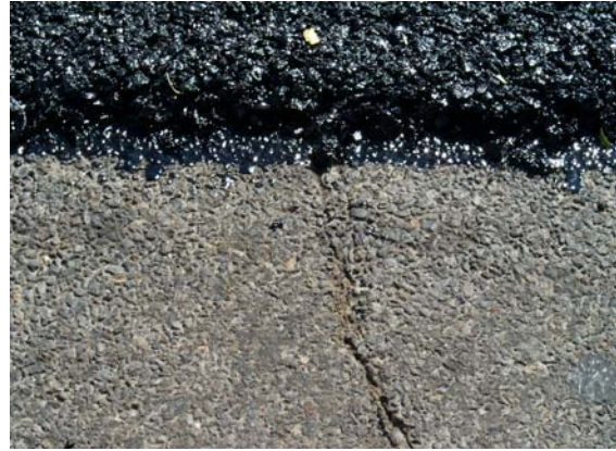
Photo 8. NovaChip® asphalt placed over existing transverse cracks.