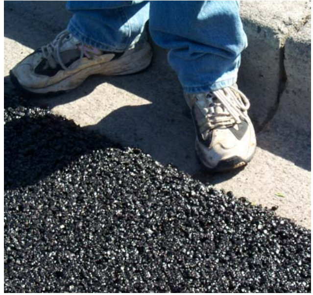
Photo 12. NovaChip® asphalt placed adjacent to curb and gutter. Rotomilling adjacent to the curbing was not done. Previous surfacings and the NovaChip® left a trough in the gutter.