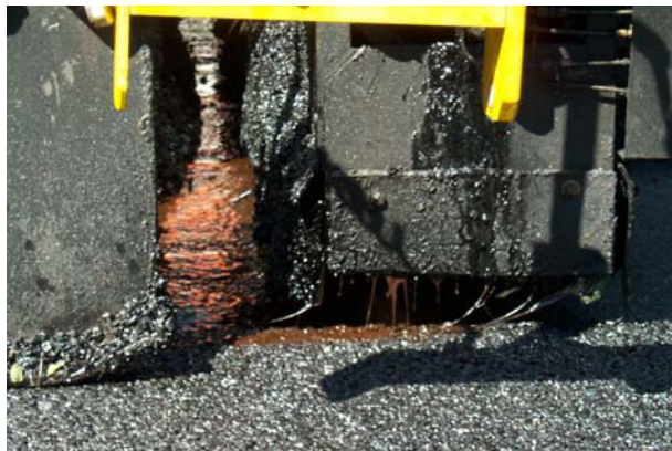
Photo 17. Novabond® Membrane being applied prior to the hot mix asphalt.

Photo 17 shows the heavy Novabond® membrane shot just prior to the asphalt placement. The spray bar is only 20 inches ahead of the screed. Photo 18 indicates the heavy thickness of Novabond® membrane placed outside the asphalt limits to ensure a full width bond.