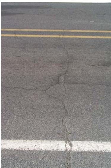
Photo 4. Typical transverse crack observed on SR 17 in Soap Lake. Repair or crack sealing is not necessary for cracks ¼ inch and less.

1 Pavement Structural Condition (PSC) is the pavement ranking according to those distresses that are related to the pavements structural ability to carry the loads. For asphalt pavements these distress include: transverse, longitudinal, and alligator cracking and patching. This ranking ranges from 100 (best condition) to 0 (worst condition).