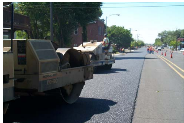
Photo 21. Compaction was completed with a 15 ton breakdown roller and 12 ton finish roller.

The initial lay down thickness for several blocks was approximately 1½ inches deep. However, once the crew became familiar with the operation the recommended thickness of ¾ inch NovaChip® was soon met. CWA was not able to maintain thickness through cross streets due to variations in the existing roadway profile. The profile grade was maintained along SR 17 with a laser system, however, the intersection of the two grades resulted in thicker pavement