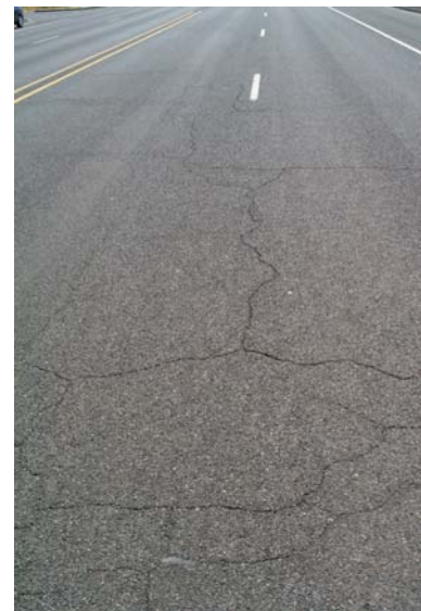
Photo 6. Cracks less than ¼ inch observed in Soap Lake. Crack sealing or repair is not necessary.