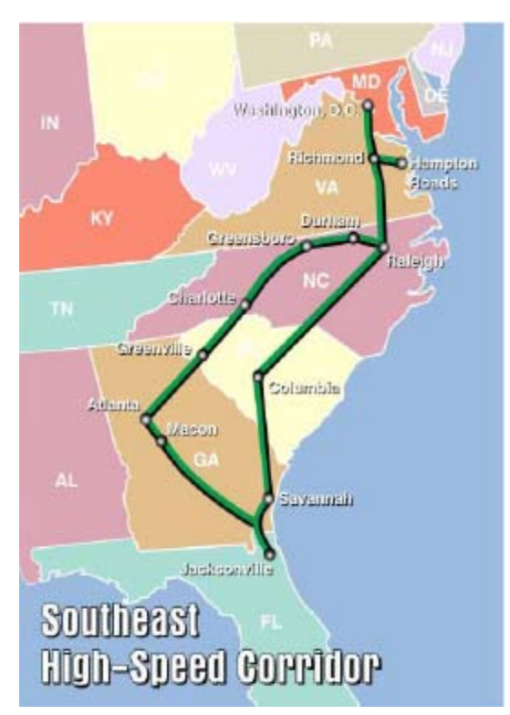
Figure 1. Southeast High-Speed Corridor

Both methods estimate that over 10 lives are saved as a result of the 189 improvements implemented through December 2004. Analysis also shows that the resulting reduction in accidents, due to the crossing improvements, is sustainable through the year 2010, when anticipated exposure and train speeds along the corridor will be increased.