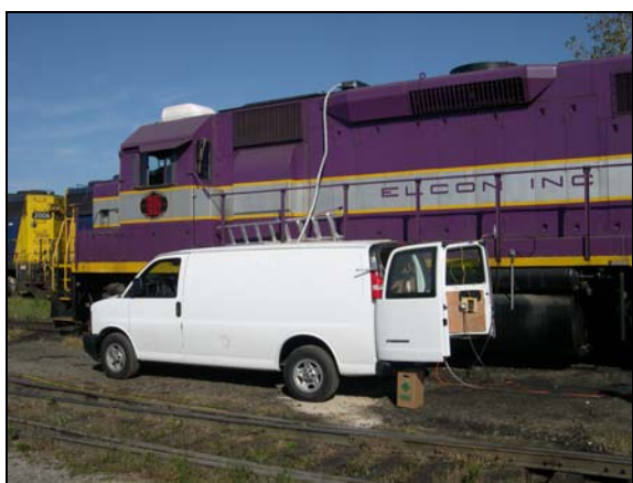
Figure 1. Locomotive emissions measurement setup.

A portable system was developed wherein the emissions and auxiliary instrumentation is transported in a cargo van and parked next to the locomotive for use as seen in Figure 1. This arrangement allows for efficient and portable measuring of locomotive emissions. The setup and measurement portion of an emissions test can be completed in 1-2 days using this system; a significant improvement over current logistics where the locomotive has to be taken out of service, and can result in significant revenue loss to railroads and car owners. Based on the test results, it appears that the tested system can be adapted to provide for an efficient means of measuring locomotive emissions.