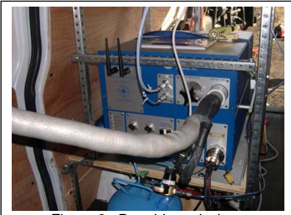
Figure 2. Portable emissions measurement system

After extensive research, a portable emissions measurement system was selected that is currently used in the heavy-duty diesel truck industry for measurement of locomotive emissions. Figure 2 below shows a front view of the emissions system.