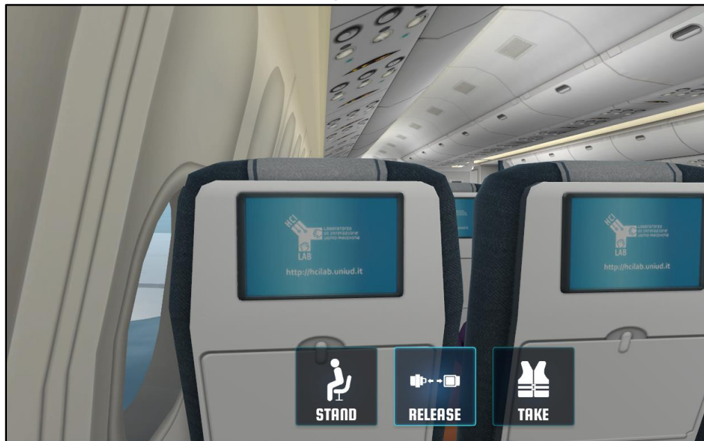
Figure 1 Depiction of Selectable Action Buttons During Simulation in ELEVAID

Note. ELEVAID = Electronic Emergency Evacuation Aid for Aircraft Passengers