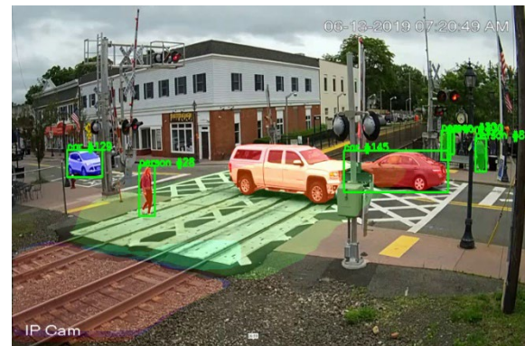
Figure 1. Example of Video Processing Output Showing Pedestrian and Vehicles Traversing a Grade Crossing in Ramsey, NJ

injuries; and there were also 525 trespass fatalities and 557 injuries at non-crossing locations [1].